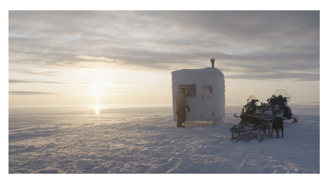
Boris B. Bertram (Dir.). In Norway, a reindeer herder removes ice from a miniature moveable hut in a landscape of light lilac snow [Film still]

Maslow's concepts of being in the present moment, and transcending time (1971: 59-60, 124, 259), as well as the notion of being deeply connected to nature as something beyond the self (1971: 60, 124, 265-266, 321). Here, due to the freezing conditions, lack of human community, and small living quarters, transcendence occurs due to a deep connection with the environment, a unique awareness of time and awareness of self in relation to it.