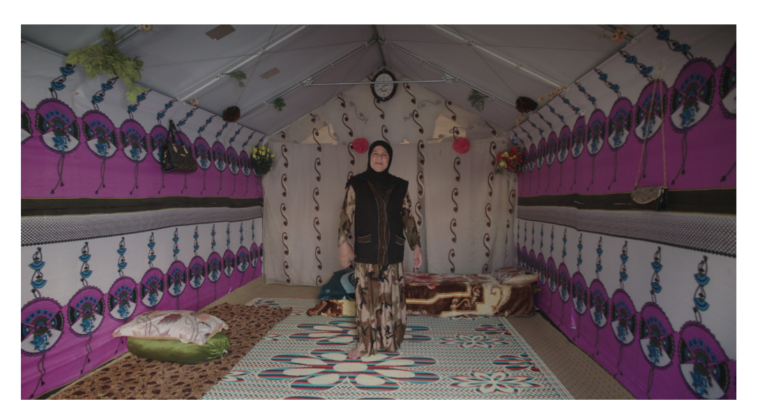
Fig. 2 Boris B. Bertram (Dir.). In Iraq an occupant of the dusty desert adorns a refugee with ornamental fabrics and rugs [Film still]

in suits, young children dance and play games despite the circumstances of being confined to a refugee camp, and hoping to return to a life, as it was—one day.