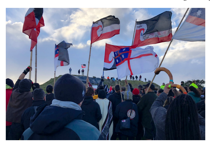
Tuputau Lelaulu (2020). Kaitiaki (guardians) and protectors karanga (call) towards tūpuna maunga (ancestral mountain) Puketapapatanaga-a-Hape during day seven of the reclamation [Photograph]

In a nutshell, Ihumātao belongs to the oldest continuous human settlement in the area, dating back about 800 years. It is tūrangawaewae (place where one belongs, with a right to stand and speak) for several groups who were evicted by colonial troops during the 1863 Waikato invasion. The Crown confiscated the land in 1865 under the New Zealand Settlements Act 1863 and granted it to a settler in 1867 (Waitangi Tribunal—Te Rōpū Whakamana i te Tiriti o Waitangi, 1985). In 2014, his descendants sold Ihumātao to Fletcher Residential Ltd, conditional on a re-zoning as a Special Housing Area—a scheme created in response to Auckland's affordable housing shortage.<sup>11</sup>