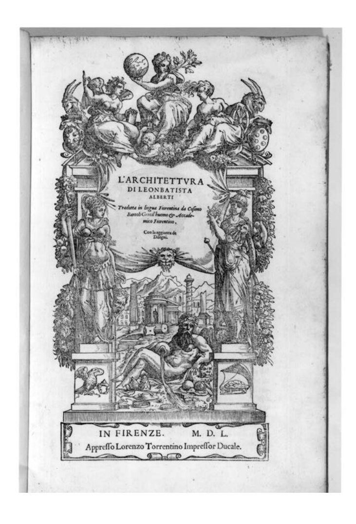
Giorgio Vasari and Cosimo Bartoli, Fontispiece

However, Bartoli also had the figure portraying the characteristics of Prudenza , the practical intellect of disegno , through her military attire and her attributes of physical valour. The concept of disegno encapsulated the capacity to represent the city, in all its forms, as a corporeal representation of governance corresponding to a metaphysical ideal. For Bartoli, the notion that art and architecture coexisted in two worlds, the divine and the corporeal, paralleled the notion that architectural creativity, although reflecting Divine creativity, derived from the architect's power to transform the idea , through disegno , into the social space of architecture. The architect's productivity was a physical enactment of the transference of beauty from an abstract principle to matter. For Bartoli, Minerva's attributes were essential in defining architecture as a higher order of intellectual activity related to civic governance.