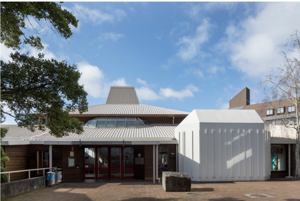
Fig. 2 The building's courtyard façade, originally designed around oak trees. The trees were felled 2013, following a particularly hot, dry summer and the partial collapse of one of the trees in a storm.

Fig. 3 The entry identifies the building by its current name. To its right is the exterior wall that originally displayed Pat Hanly and Claudia Pond Eyley's large mural, now moved inside to help ensure its longevity.