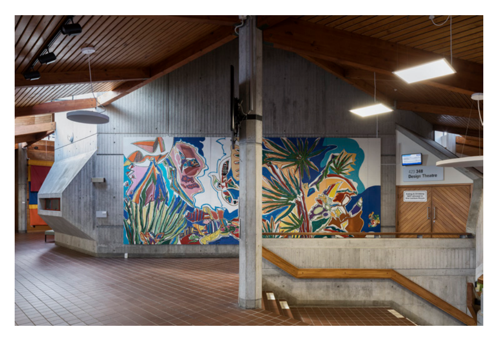
Fig. 9 Entrance to the Architecture and Planning Library, where the walls have presented an everchanging array of exhibitions of books, journals, posters, and drawings.

Fig. 8 The generous stair from the entry level down to the Architecture and Planning Library. The concrete block wall shows the ghostly traces of Architecture + Women New Zealand's timeline, posted for the School centenary in September 2017 and removed in August 2018 after an 11 month showing.