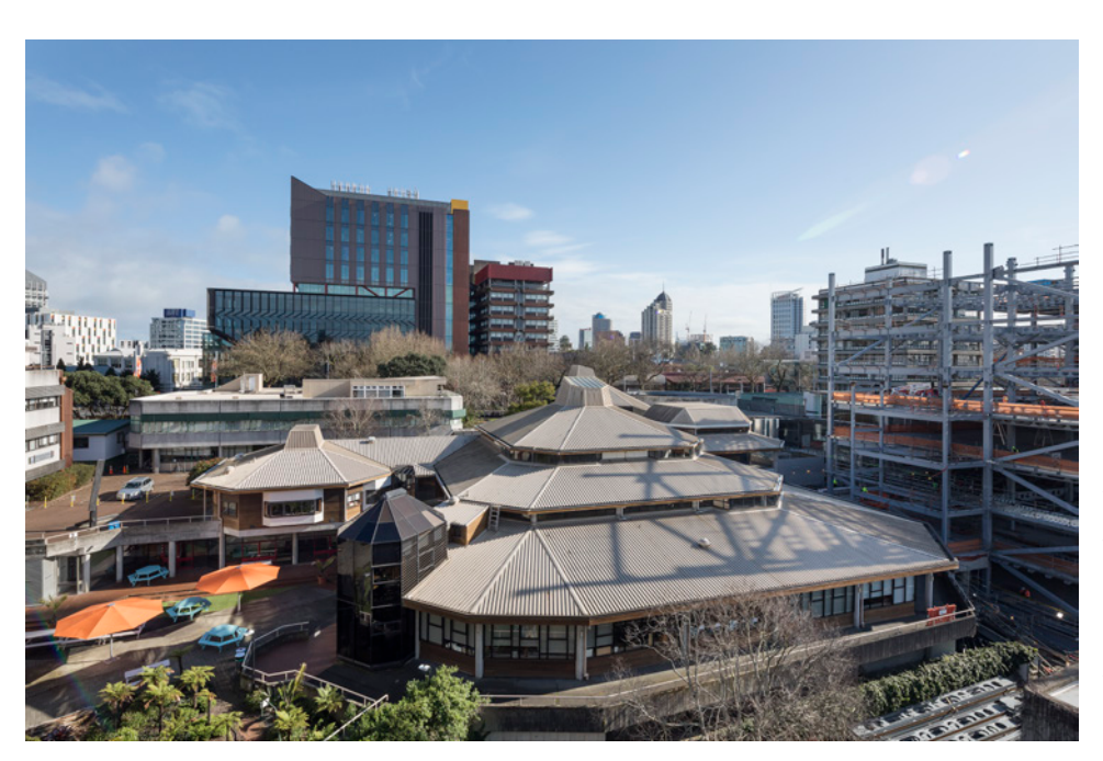
Fig. 1 The complex roof forms, with the Architecture and Planning Library in the foreground. It sits back-to-back with the Design Theatre (under the turret), with the Dean's Office to its left (south), and the Conference Centre Lecture Theatre and so-called Flat Floor Space to the right (north). Construction of a new building for the Faculty of Engineering is underway.