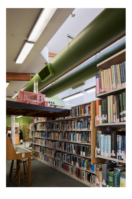
Fig. 12 The Architecture Archive, combining drawing cabinet upon drawing cabinet of large format work, box upon box of files, and a compactus of old books and journals.

Fig. 11 In addition to the collections of books and journals, the Architecture and Planning Library has long displayed student drawings and models, all of which contribute to its character and atmosphere.