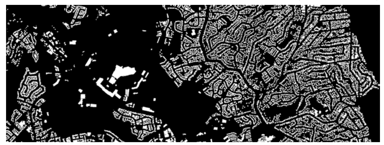
Fig. 01 Figure-ground map of Albany Metropolitan Centre showing the spatial relationship between the mall and the urban fabric.