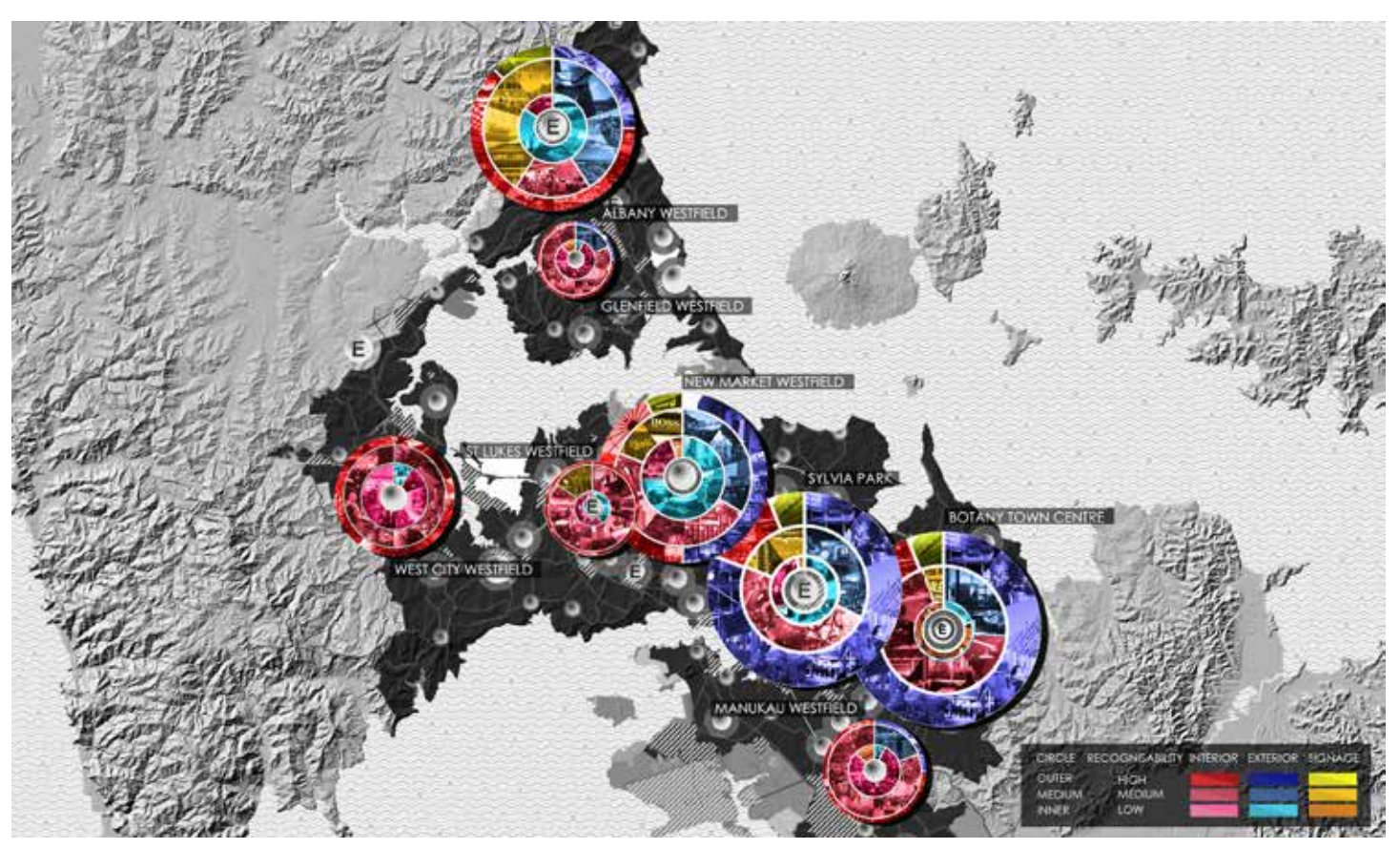
Fig. 05 Map of Auckland malls' memorability index in 2014, representing the relative value of heterotopic spatial representation. [Courtesy: Manfredo Manfredini and Jisoo Jung."]