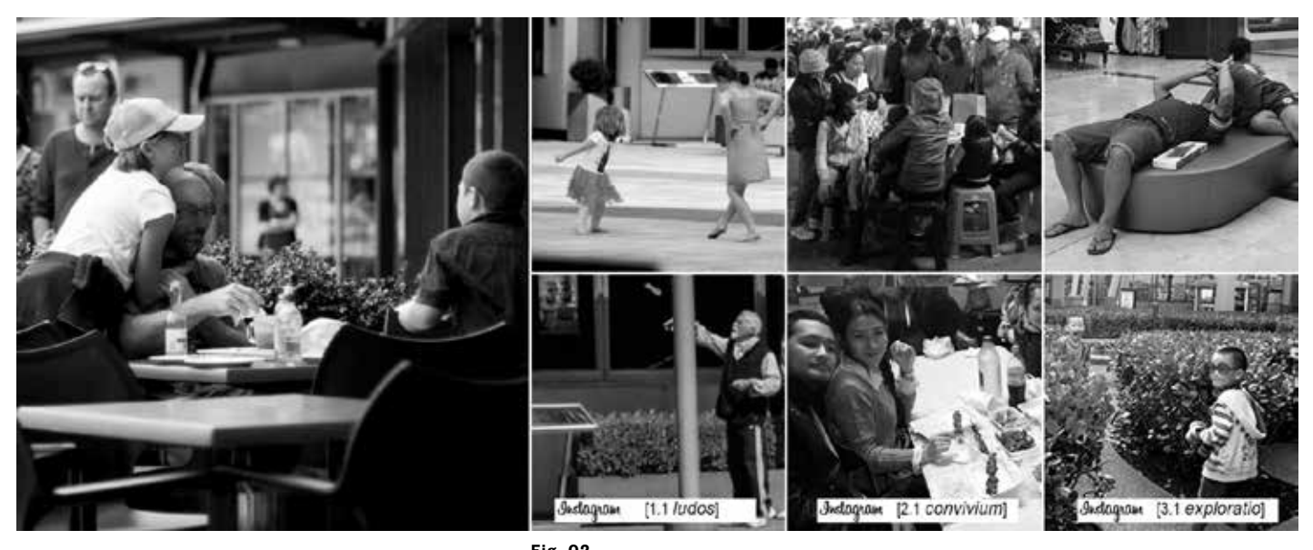
Sample of images posted on social media (Instagram) in 2014 within the malls precincts and classified in different socialising consumption sub-categories.