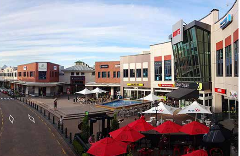
Fig. 06 Town Square inside Botany Town Centre in 2014.