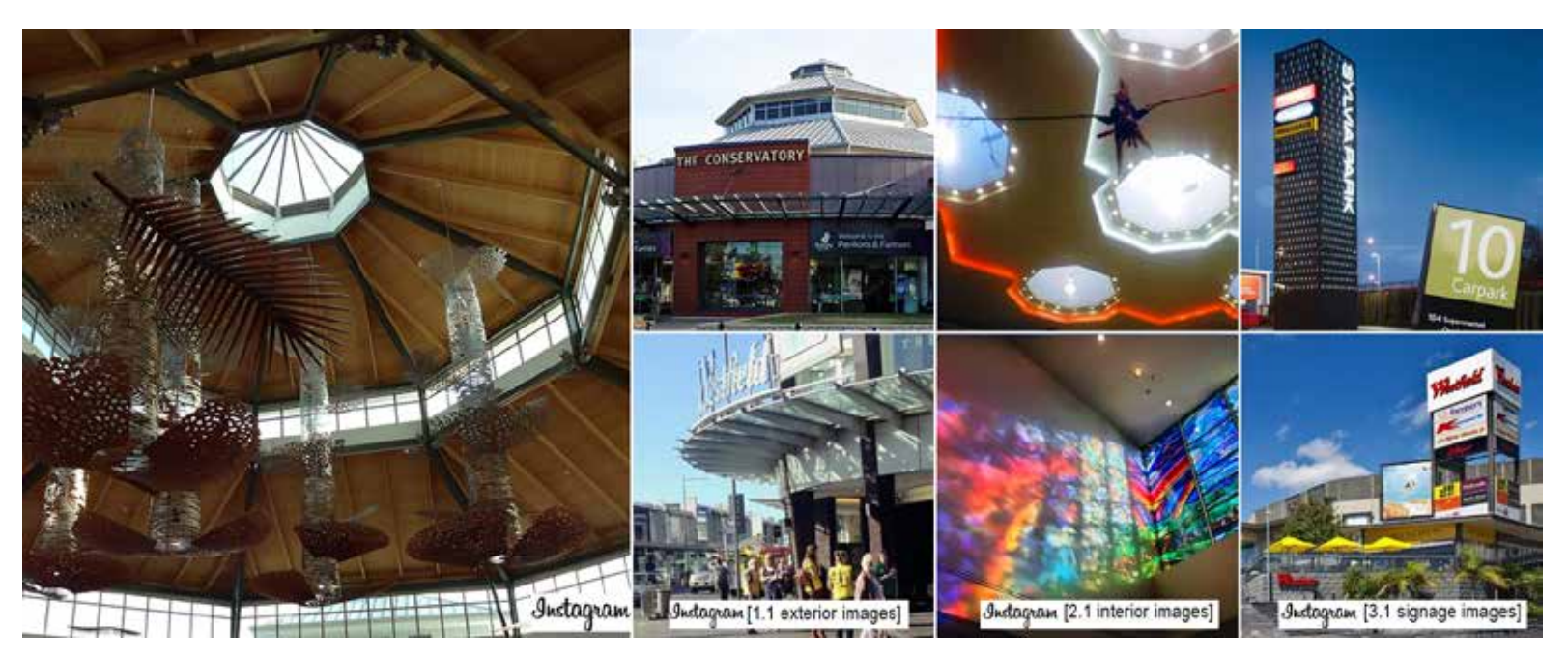
Fig. 04 Sample of images posted on social media (Instagram) in 2014 within the malls precincts and classified in different spatial memorability sub-categories.