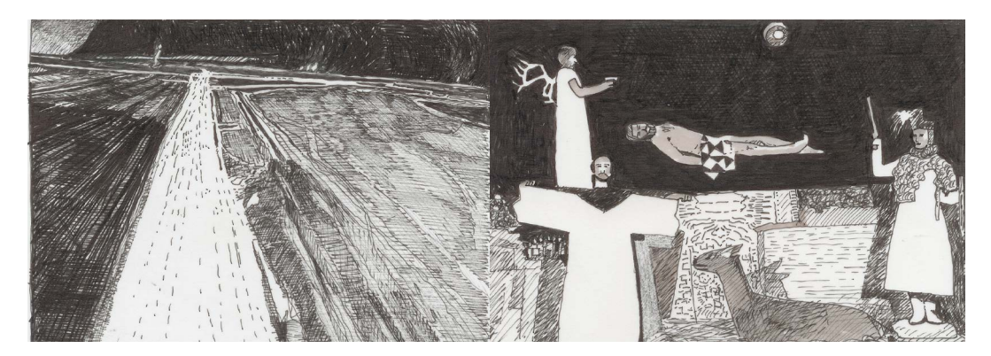
Fig. 19 Sergei Paradjanov (1968). Sayat nova. [Film still drawing: Author, 2009.]

considerable semantic texture (2010: 126-130)^4 and the geometrical incommensurabilities in the spatial setup of Sigurd Lewerentz' St Peters that engage with the tragic dimensions of Christian theology (2010: 305-309); as well as in cinema – for example the multiple coincident temporalities in Nicholas Roeg's Bad Timing that challenge accepted notions of causality (2010: 70-71, 153-155); the narrative, material and geometrical layers in Sergei Paradjanov's Sayat Nova that translate the film into an iconostasis (2010: 101-103) and the distinctive image and sound juxtapositions of Werner Herzog's Lessons of Darkness that evoke an altered existential milieu, an ekstasis that enables the film to depict the hubris of human excess (2010: 175-176).