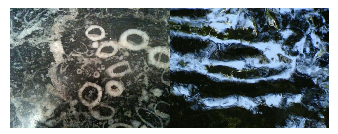
Fig. 9 Remains.

but also and is antithetical to the aporetic condition or impasse where we find ourselves "without-passage". Between potentiality and actuality, the material and the immaterial, one idea and another, existence is always through something that resists and prohibits; it is always a trajection of some kind, a perforation of some boundary plus the material obduracy of that boundary. There must therefore be a sort of porous, aerated, permeable materiality to the structure of atmosphere: a distributed network of hollows, a disparate consistency made of gaps which never close up or fuse into a unity. Like the vaporous fog that dissimulates everything into an undifferentiated matrix, atmosphere maintains everything in a suspended state of potential, keeping it always provisional and on the verge of arriving.