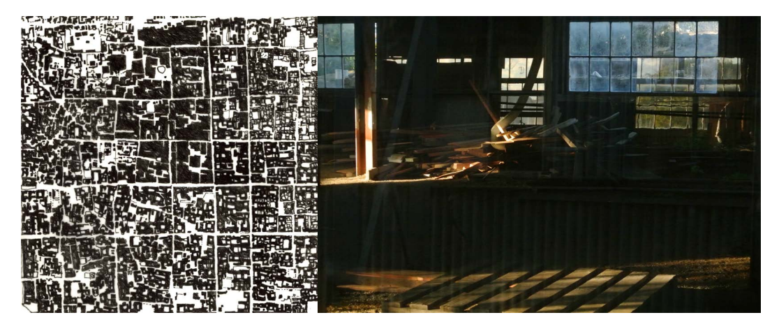
Fig. 17 Plan of Jaipur. [Drawing: Author, 2007]

into its azure field. Because of such dissonances, Mozart's score and the Tavianis' scene achieve musical and cinematic expressions of an archetypal motif: the impossibility of fulfilling desire. As Deleuze and Parnet noted (2004: 'désir'; see also 1996: 8-15), we never desire one thing (a person, a coat, a fragrance), we always desire an assemblage, a complexion or inter-folding of multiple conditions (a person + a coat + a fragrance); we always desire a milieu, a world – that is, an ambiance. In the film's exquisite conjunction of narrative, image and sound these disparities parallel the narrator's desire to recollect his past, his desire for the mother and her youth, the mother's desire to relive and retell the story, the child's desire to join her siblings, the desire of the children's falling and mergence with the sea, and an overarching and tragic desire for surrender and release – a veritable "authentic being-towards-death" (Heidegger 1962: 255) that is constitutive of ex-static being-in-the-world.