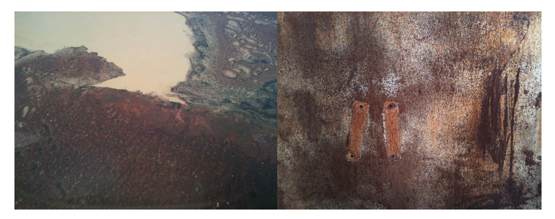
Fig. 5 Lake Eyre.

how it looks), convey something fundamental about the person or the place. How we look (whether we calculatedly lock and violate or incarcerate the looked-at; whether we look-after or look-out-for it; whether we look with kind regard, with an eye to solicitude and care) can debilitate or enable, destroy or create. The look of a being, its appearance, is the aura that forefronts it, that brings it into view; but it is also a sphere of influence, with affective powers that can induce change.