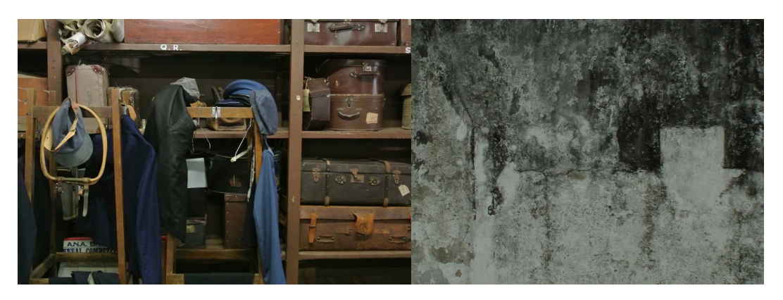
Fig. 1 Things.