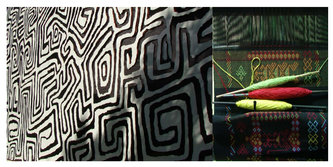
Fig. 13 Jackie Kultjunyintja Giles Tjapaltjarri with Cracknell & Lonergan Architects (2009). Jjamu Tjamu, public artwork, Fox Studios.

There is another sense in which the interstitial and porosity are important for atmosphere. Such a sense hinges on the necessary structural condition of unaligned multiplicity – that is, an ordering system of multiple, coexistent components that resonate without fusion, that defer one to the other without ever being resolved into a singularity. Such a system might be semantic and consist of multiple coexistent meanings that produce consilience between them while remaining separate; or it might consist of multiple spatial or geometric systems overlaid within a single building but without coinciding. In such cases the resultant order remains discrepant and incommensurable – that is, it maintains porosity. Yet, in their interstices, the concatenation or conjugation of these systems within the assemblage begins to produce emergent conditions that were not present in any of its component parts (Delanda 2006: 2012).