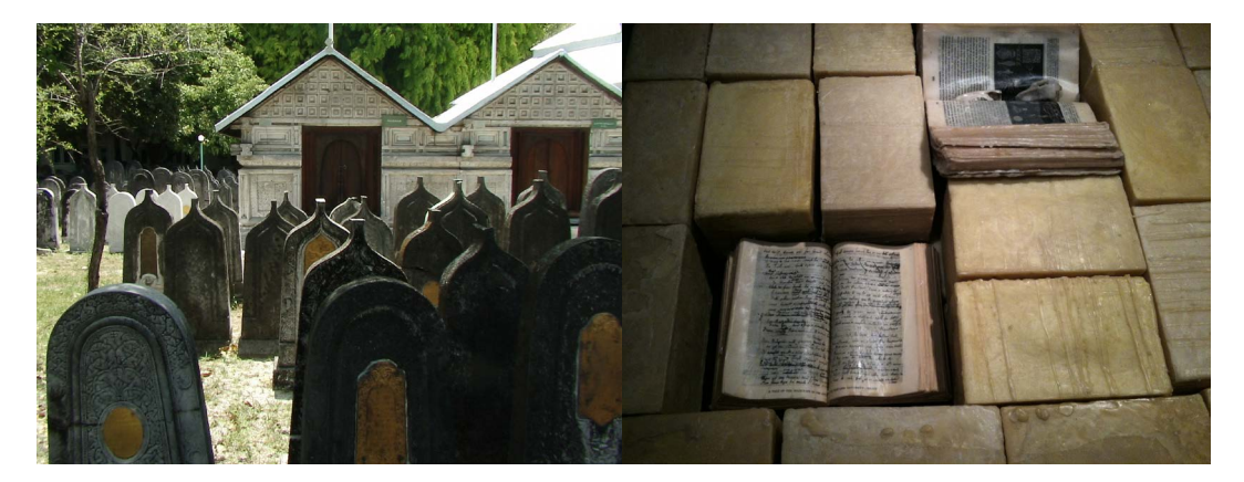
Fig. 11 Maldives.

Interstice, interval, milieu – these constitute a surrounding or medium; a mathematical mean, a tectonic intermittence and an ethical mediality, mediatedness or mediance (Berque 1990): that is, a way of being-with-our-self, with-others and with-the-world. This is Heidegger's Mitsein – the authentic manner of being-there-in-the-world as encounter, necessitating attentiveness towards things and others that is characterised by care ( Sorgen ), concern ( Besorgen ) and solicitude ( Fürsorge ). As Bernard Stiegler notes, "the self is indissociable from care ( soin ) in as much it has a double dimension that is psychic and social , so that to take care of oneself is always already to take care of the other and of others " (2008: 283). The solicitude which characterises care is caring-for in the sense of having regard for the welfare of the other, to liberate and make room for them to be there also (Heidegger 1962: 158-9); to solicit out of potentiality and thus enable something, someone or some ones to emerge and surge-forth-into-presence. The topography of the porous, the interstitial and the inter-ludic must be resolutely ethical.