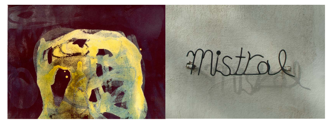
Fig. 7 Head. [Drawing: Author, 2010]

Cities are enormous madrepore in whose tangle, and in the midst of whose concrete or chalky matter, there will never pass enough passages and bridges and canals and ventilating chimneys and flowing spaces and interstices and clearings. (Gaudin 1992: 122)<sup>1</sup>