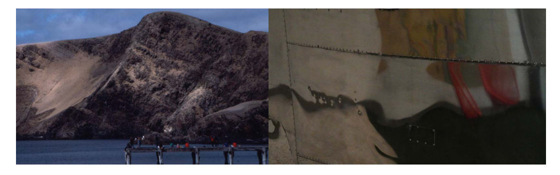
Fig. 15 South Australia.

There is another sense in which the interstitial and porosity are important for atmosphere. Such a sense hinges on the necessary structural condition of unaligned multiplicity – that is, an ordering system of multiple, coexistent components that resonate without fusion, that defer one to the other without ever being resolved into a singularity. Such a system might be semantic and consist of multiple coexistent meanings that produce consilience between them while remaining separate; or it might consist of multiple spatial or geometric systems overlaid within a single building but without coinciding. In such cases the resultant order remains discrepant and incommensurable – that is, it maintains porosity. Yet, in their interstices, the concatenation or conjugation of these systems within the assemblage begins to produce emergent conditions that were not present in any of its component parts (Delanda 2006: 2012).