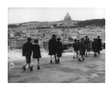
The final scene of Rossellini's Rome Open City (Excelsa Film 1945)

The traumatic disruption of everyday life caused by World War II and the Reconstruction that followed reconfigured the relationship between 'inside' and 'outside' spaces in post-war Rome. This transformation was projected onto the Neorealist screen in different forms, reinforcing the crucial shifts between centre/periphery, domestic/urban, interior/exterior.