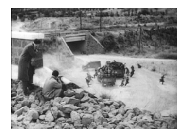
The Resistance fighters ambush the German soldiers in the periphery in Rome Open City , (Excelsa Film 1945)