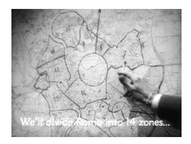
The Gestapo's Schröder Plan (Excelsa Film 1945)