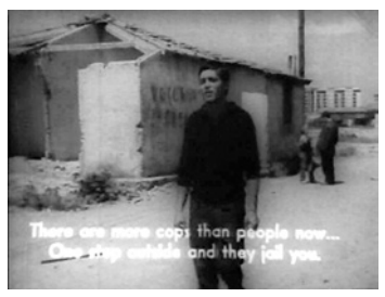
A scene from Pier Pasolini's film Accattone , where the main character walks by a building, its graffiti calling out "We want housing" (Arco Film 1961).