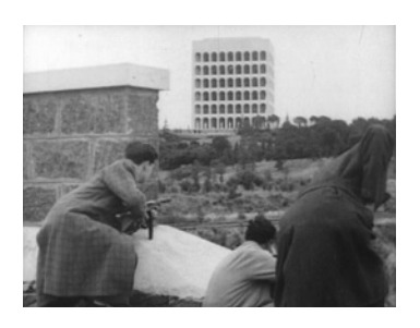
The Resistance fighters wait to attack German soldiers in the periphery of Rome near the Tiburtina Bridge in the shadow of the Palazzo della Civiltà Italiana , an icon of fascist architecture (Excelsa Film, 1945)