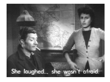
The map of the Resistance in the background encompasses Rome and the entire Lazio region (Excelsa Film 1945)