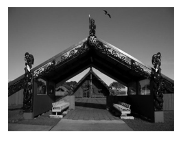
Waha roa at Orakei Marae, Auckland (2003).