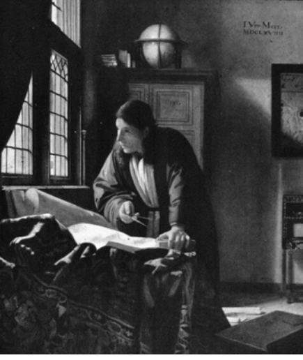
Johannes Vermeer The Astronomer (1668) and The Geographer (1668-9).