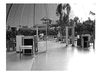
Entrance to Tropical Islands Resort, Brandt, Germany (2006).

masses" (Gunning 2003: 106). Over time, this concept of interiority became central to Western self-understanding. Today, it is hard to unsettle and colours completely our notions of inside and outside, occluding a diversity of spatial relationships.