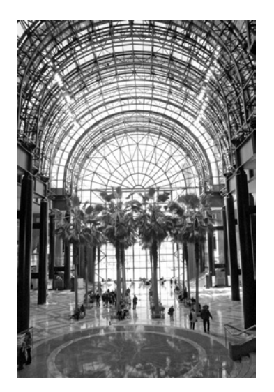
World Financial Center Winter Garden (2007).