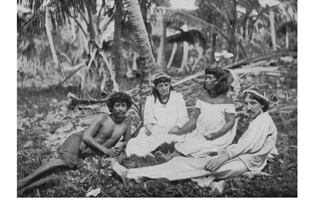
Fig. 6: Stevenson in Samoa. Art and Architecture, 5(4), (1908): 144.

writer's journey into the forest depths in which "long streaks of sunlight were streaming through the tree tops, reminding us of the lights coming though the windows of a cathedral," an echo of the theoretical association that forests have with the origins of Gothic architecture.