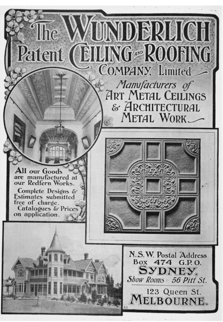
Fig. 7: Advertisement. Art and Architecture, 4(6), (1907): xviii. Fig. 8: Advertisement. Art and Architecture, 5(5), (1908): xviii.

This was an important audience for those advertisers wanting to increase their presence in the burgeoning marketplace of domestic architecture. Two of these advertisers were the Wunderlich Patent Ceiling and Roofing Company and G.E. Crane & Sons, both escalating marketing campaigns for their decorative wall and ceiling panels in the 1900s. In 1907 and 1908, advertising by Wunderlich featured images of large suburban houses showing the interior use of its metal ceiling panels embossed with natural patterns and motifs (Figs. 7 & 8). Several years earlier, Wunderlich had hired Samuel Rowe, a designer trained at the South Kensington School in London, to create modern panel patterns, some of which were based on native flora, including the waratah (Bures 1987: 60).