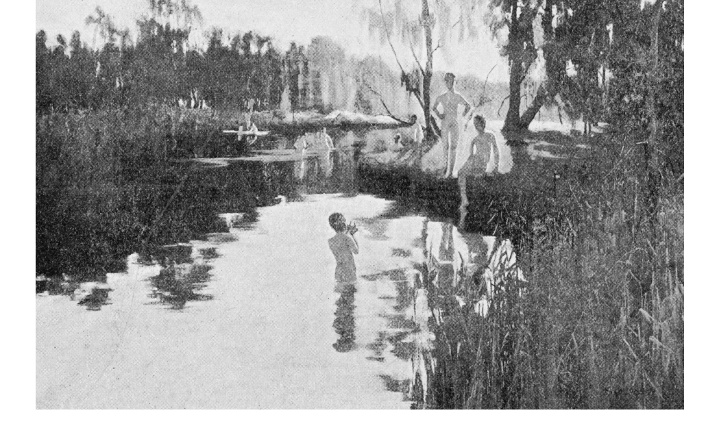
Fig. 4: Sydney Long, The Bathers, 1894. Art and Architecture, 2(2), (1905): 63.