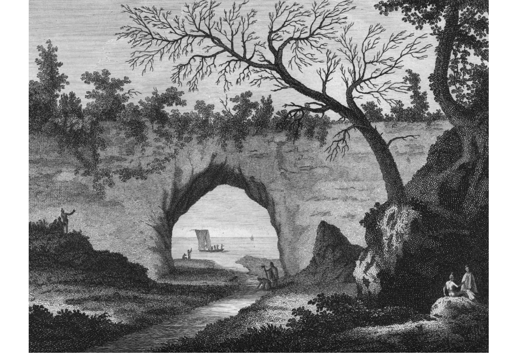
Fig. 1 "View of a curious arched Rock, having a River running under it, in Tolago Bay..." In Parkinson, Journal of a voyage to the South Seas. 1784. J.C. Beaglehole Room, Victoria University of Wellington. Fildes 1533.