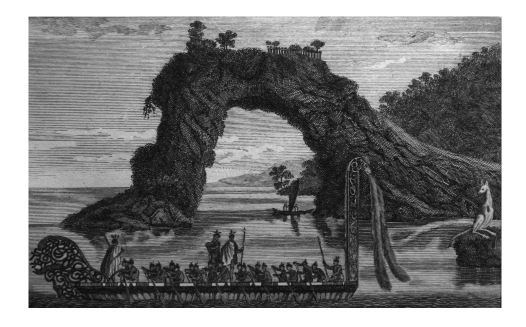
Fig. 4 "Hippa or Place of retreat on an Arch'd rock in New Zealand with War Canoe & a Non-Descript Animal of New Holland." In London Magazine, August 1773, Private collection.