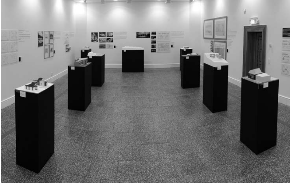
Gallery 1 contained drawings, models, photographs and text focusing on eleven of the 180 buildings included in the book.