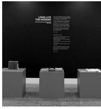
Inside Gallery 1, the black wall explained the role of DOCOMOMO, the international working party for the DOcumentation and COnservation of buildings, sites and neighbourhoods of the MOdern MOvement.