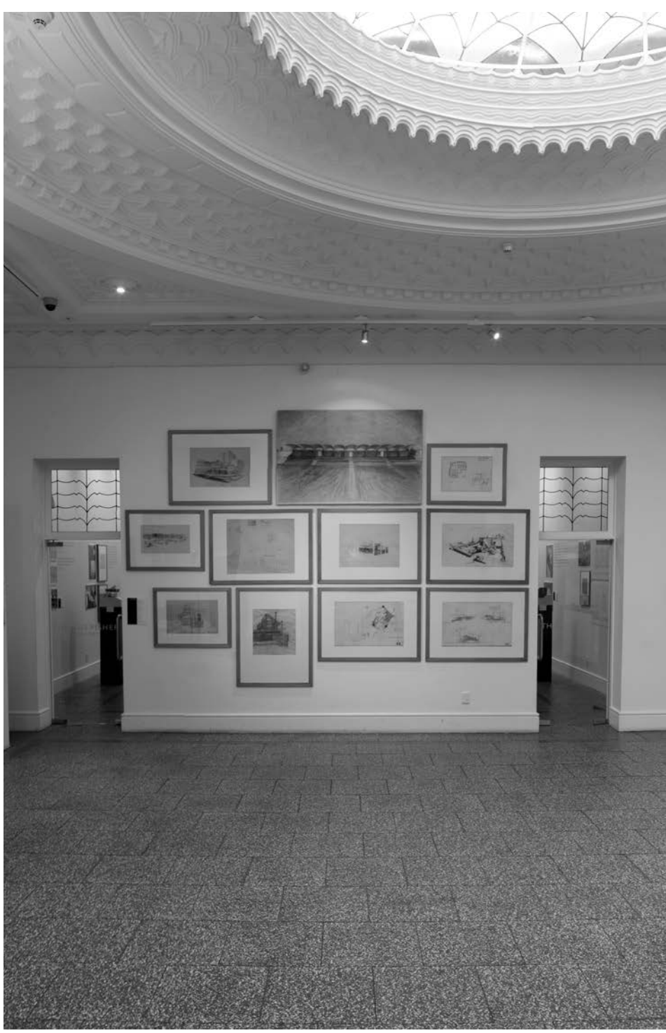
Drawings from the Architecture Archive, The University of Auckland.