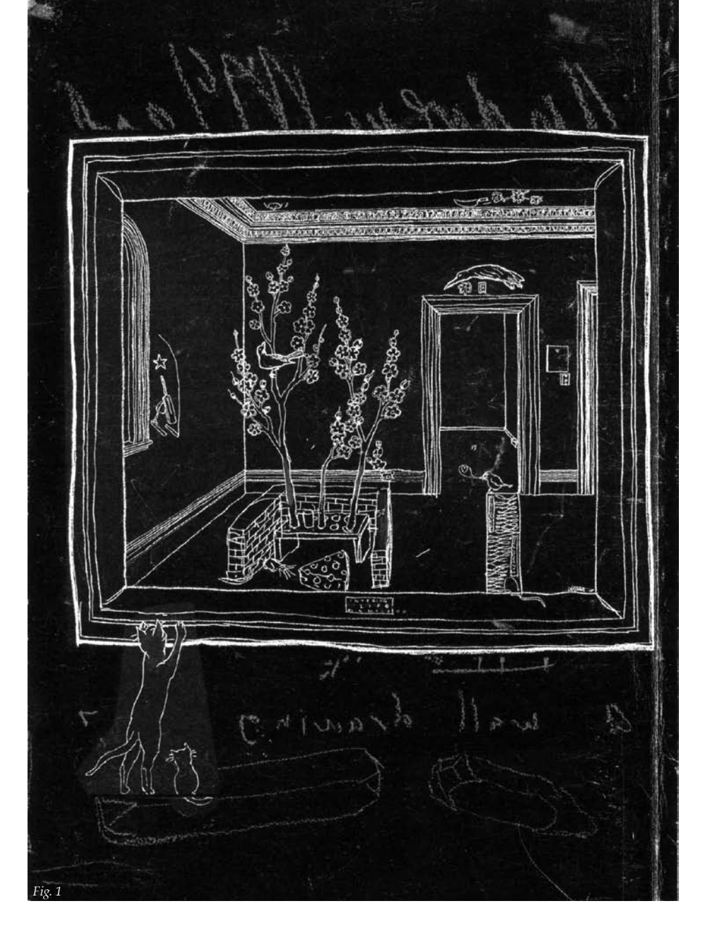
Fig. 1: Andrew McLeod, Interior Life: A Wall Drawing (detail).

new beginnings (Fig. 1). In a reseeding of a post-global world, McLeod drew a cow, a monkey, a bird, a cat and kitten, a bear and elephant (eyeing ice-cream). He inscribed a cat and cheese, cat and acorn, monkey up tree with camera and whirligig, kangaroo, goat, animal stack consisting of donkey, dog, cat, rooster, rabbit and escaping butterfly and fly (an escape from an interiorizing meal of animals laid within other animals), snake, lion, squirrel, rodent tail and lovesick bird. The architectural orders of Piranesi, that were also remnants or signs of a natural order (Corinthian baskets sprouting acanthus leaves), are multiplied in McLeod's aberrant domestic.