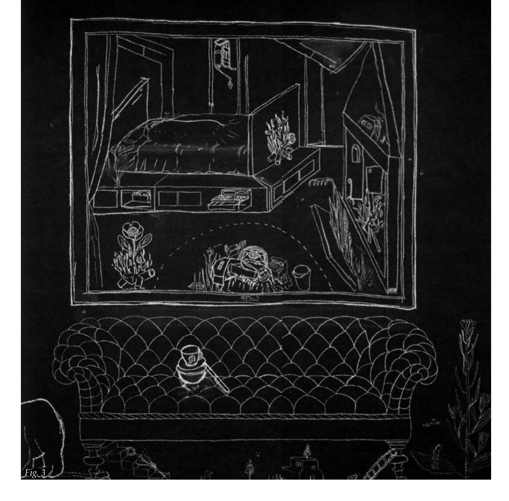
Fig. 3: Andrew McLeod, Interior Life: A Wall Drawing (detail).

In Andrew McLeod's work a similar set of steps, without ornament or handrail, lies under a chesterfield, climbing from the floor (Fig. 3). Repeating the scale shifts of the prison, the couch has become the world to a miniature house, tree and chair. The chesterfield (encrusted with debris from small domestic rituals), beneath which the small world crouches, and from which the steps climb, is itself beneath a world beyond. Above the chesterfield is a framed scene inscribed on the gallery wall. It is a scene of marital nightmares: the double bed, which lodges in the warped perspectival space of the bedroom, is inhabited by one occupant who seems to be a small coffin with blankets drawn up to the 'head'.