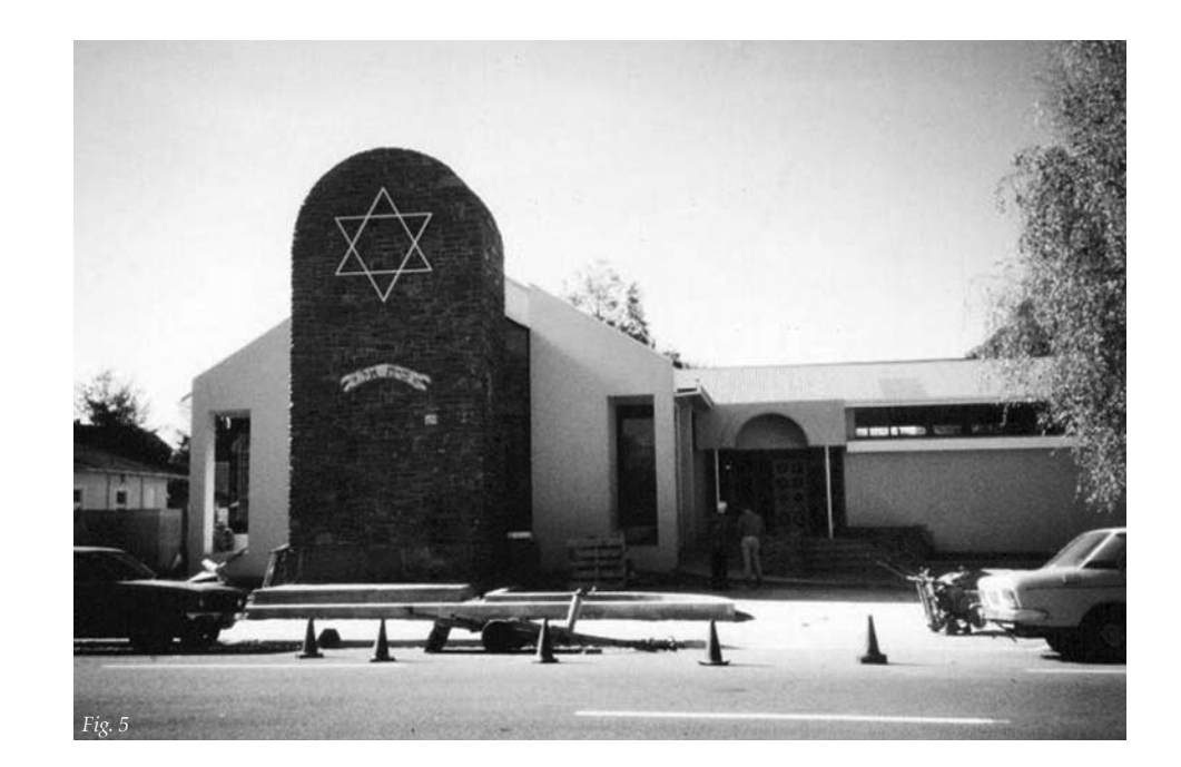
Fig. 5: The exterior of the new Durham Street synagogue.

9 It may be assumed that Mountfort. the architect of the early shul, was simply too busy to design the replacement synagogue. At that time, Mountfort was continuing his building programme in Rangiora with the Anglican Church of St. John the Baptist (1859-82) for the Rev. Benjamin Woolley Dudley, and he was also supervising construction of the Christchurch Cathedral (Macdonald, 1964; see also Sweely, 1988: 6-23).