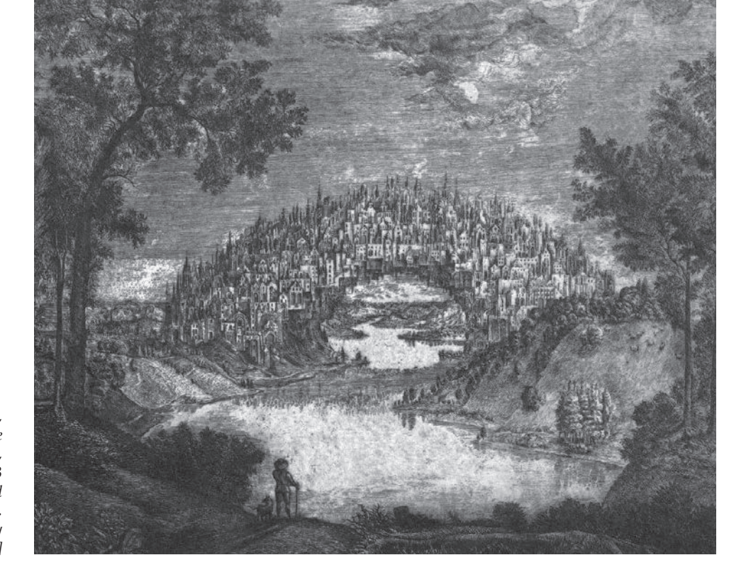
Brodsky & Utkin, Crystal Palace, 1989/90 (Plate produced / Plate printed) from Projects portfolio, 1981-90, 35 etchings, ed. of 30, 43 x 31 3/4 inches (F). [Originally drawn and published in 1982]

communist party resolved to abandon "excesses in design and construction" and to outlaw officially "nearly everything which had motivated architecture in the preceding twenty years: historicism, orientation to Classicism, richness of material and abundance of detail" (1994: 123). This impacted on the localized distribution of the sensible, changing what could be appropriately seen, spoken of, or propagated as architecture. By abolishing the production (the act of making visible) of a particular architectural approach, and by banning pedagogy associated with this aesthetic, the connection between the power of the state and its symbolic or literal depiction is manifest (Cooke, 1988). As Lois Nesbitt notes, from that point in time the communist party in Russia considered "aesthetic discourse of any kind … unnecessary and immoral" (2003: n.p.). It is against this political backdrop that Brodsky and Utkin's architecture is viewed and interpreted in conventional architectural histories.