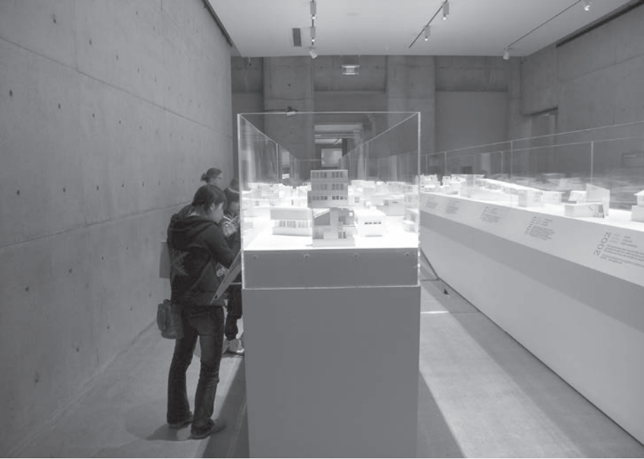
Figures I and 2: The model display in the 'concrete gallery'.

misrepresented is Mike Austin's Chapple house—one struggles to recognize the house without its pohutukawa pivot and its black lava brink. More satisfying, however, is the exception: Andrew Patterson's Summer Street courtyard house, where site-is-house-is-model. Plans and site plans would have enabled this fuller comprehension in other cases, as too might have the alternative medium of digital and photographic modeling, with the added advantages of permitting a much increased range of house samples, as well as a means of readily reproducing them all.