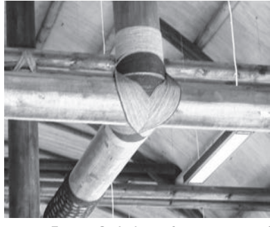
Figure 3: Lalava, fata section of the Fale Pasifika, The University of Auckland, 2004.

2. The fale is in some sense treated like an upturned boathull. In fact, the technology used for its construction is based on replaceability of its components or parts, just as parts are replaced when boats are serviced. With the use of lalava, the joints or members are not weakened by cutting, drilling or nailing. The fale could even be portable: in his book Tongan Society (1929), Gifford mentions early voyagers' accounts of portable houses set up at convenient places near anchorages for the reception of visitors.