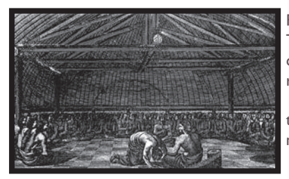
Figure 1: Inside the Falehau, Tonga, in 'A new, authentic and complete collection of voyages round the world ...' London 1784. The image shows the tectonics with lavalava connecting the structure.