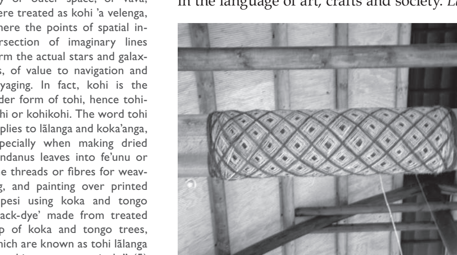
Figure7: Lalava pattern, Fale Pasifika.

From an anthropological perspective, the Tongan concepts of "such things as the sky, the human body, and social practices such as lãlanga (weaving) and koka'anga or ngatu -making" are all "associated with the lineal and the spatial" (Mahina, 2002: 5).6 Lalava is a term made up of two words, lala and va. This two-word scenario is a common occurrence, especially in the language of art, crafts and society. Lala means to intersect, as in the