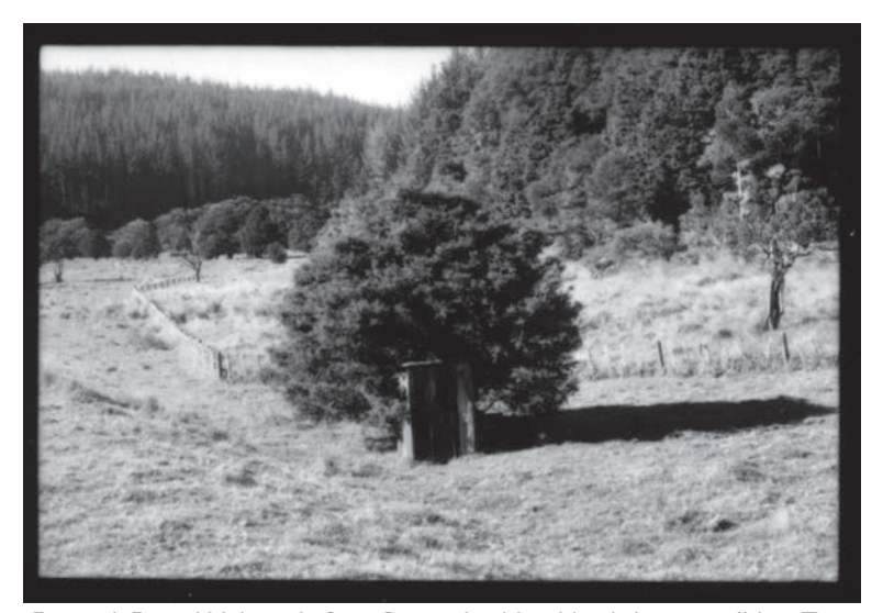
Figure 4: Daniel Malone, In Situ, Opouteke, Northland, Aotearoa/New Zealand, (Partially Covered Outhouse), 2004, Black and white photograph.

The water closet might have represented an achievement in nineteenth century Europe, with its particular problems of over-crowding. But a peculiar myopia excluded from perception historical and geographical particularities such as the vast difference between the metropoles and the hinterland in Europe, or earlier observations of barbarians and civilised such as Hawkesworth's notes about hygienic conditions in Anaura Bay in 1769. These lapses of historical and geographical awareness supported a particular ideological system by which one type of toilet comes to mean something different from another, in peculiar ways. The perception of the