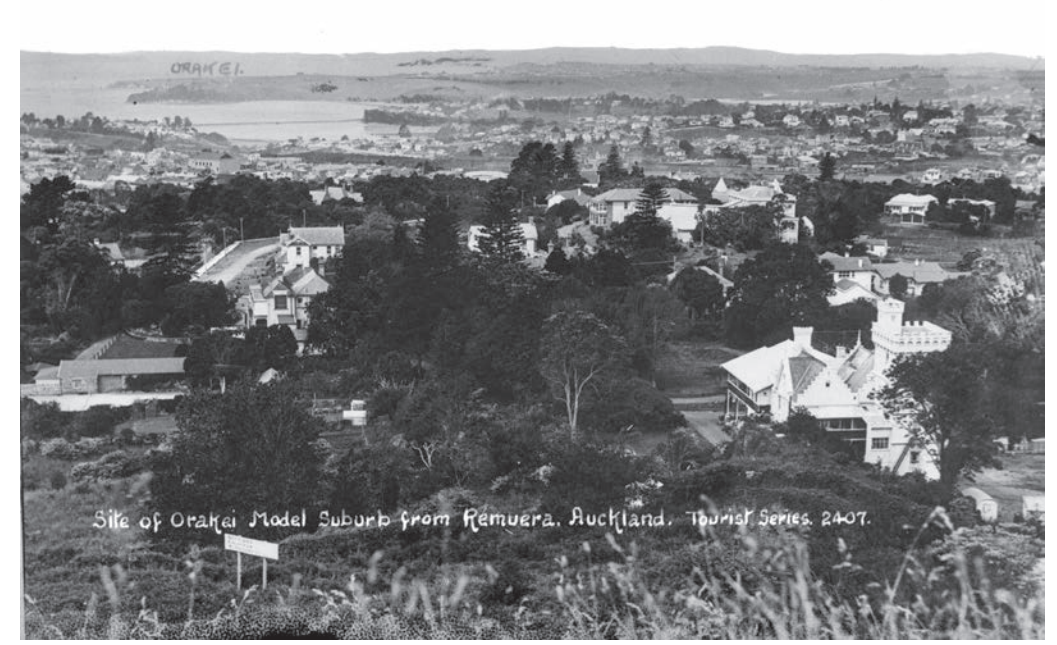
Figure 6: Frederick G. Radcliffe, Looking north east from Mount Hobson towards Orakei showing a real estate sign in foreground, "Sections Finest View Winstone Ltd".

Much of what happened at Okahu Bay (Orakei) in the 1950s, <sup>28</sup> for example, was justified by references to hygiene and health: Ngati Whatua, in their struggle to maintain their rights of occupancy at Okahu Bay, found their efforts over decades of court procedures blighted by health concerns. Thus, a 1935 sanitary report held "swampy conditions and inadequate drainage" against the continued existence of the Okahu Bay papakainga (habitation).