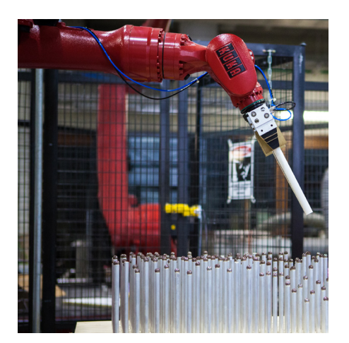
Fig. 4 "Pixel Table" and robotic arm

geometry determined in the design model using a robotic arm. Analyses in the digital model identify where the design curvature exceeds the minimum radius that the pixels can form and the design model adjusted accordingly. Each panel is vacuum-formed on the Pixel Table then trimmed using a water-jet cutter. The butt-joints between panels will be taped and set then finished with heat sensitive dichroic paint.