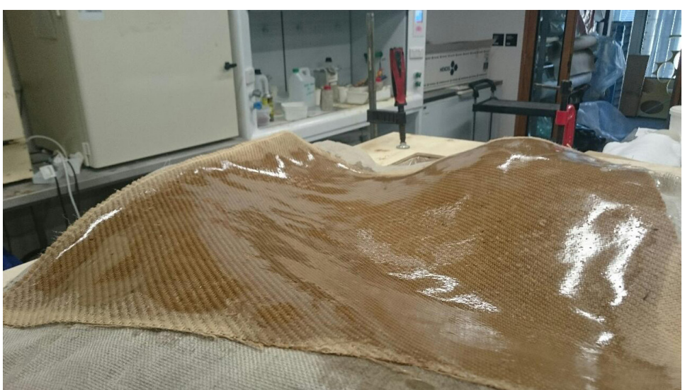
Fig. 5 Biocomposite prototypes