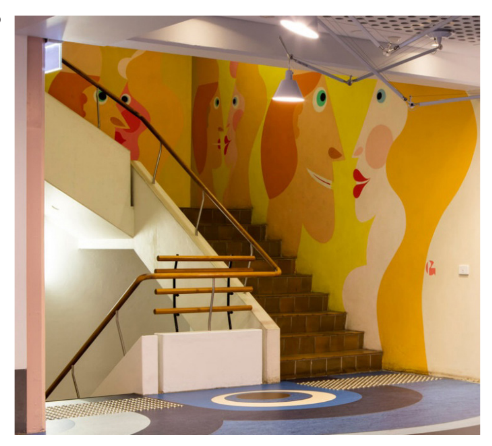
Fig. 2 Mural by Pancho Guedes (1977) Photo: © Brett Boardman]

Therefore, this experimental structure simultaneously explores thinness—thinness as spatial and technical propositions. The project was developed in parallel with a small renovation to the School of Architecture at UQ designed by m3architecture. The architect's idea was to draw on the inherent qualities of a mural in the space painted by Pancho Guedes [circa 1977] "which tells a story of chance meetings, shared ideas and joy" (m3architecture, 2016).