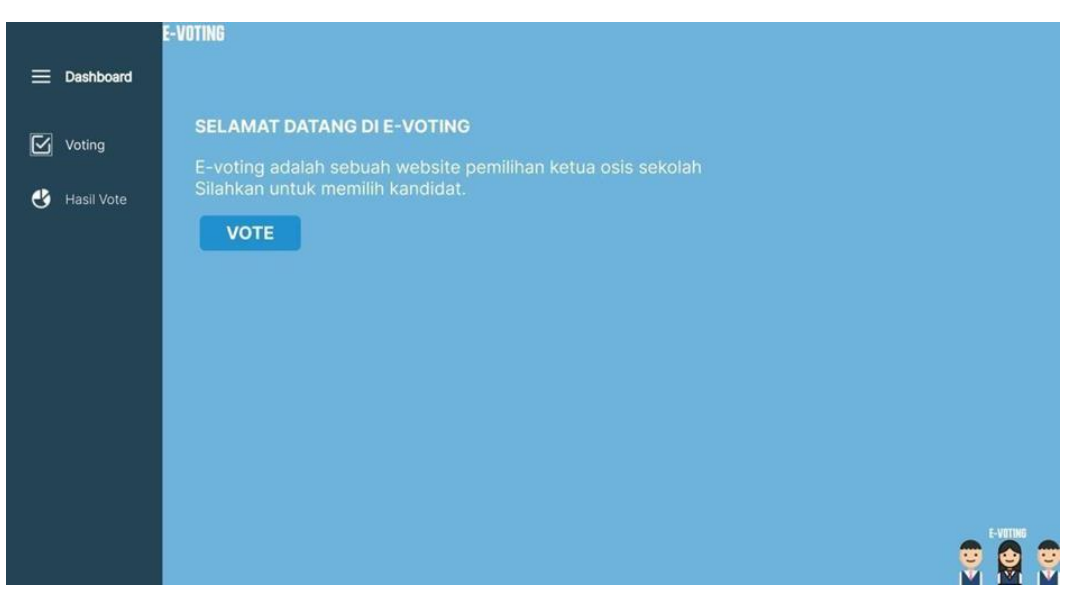
Figure 3. Page Dashboard E- Voting

An example of an e-voting login page design can be seen in the image above first containing form login and then enter the username and password aim so that para user could come in, with a user account which has provided by the school, using their name and password in the form of date of birth, so that could help monitor user which already select, then when you have entered your username and password, you will be redirected to the next page [8,9].