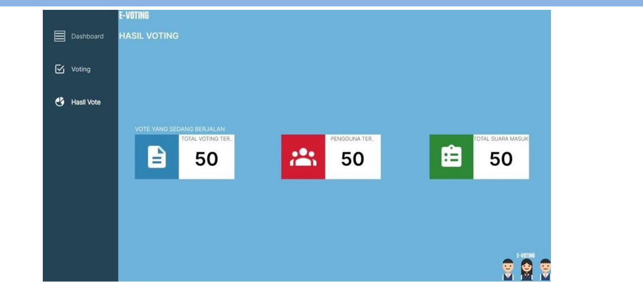
Figure 5. Results Page E- Voting

2(2)(2022) 67-72 Journal homepage: https://ojs.unikom.ac.id/index.php/injuratech