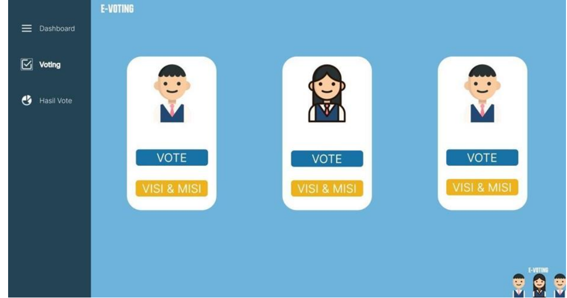
Figure 4. E-Voting Page

information provides information at a glance, when we click the vote button, a different view or contents of the menu will appear.