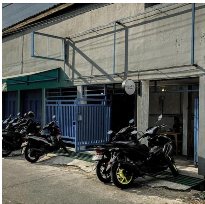
Figure 1. Muara Coffe and Space

2(2)(2022) 24-30 Journal homepage: https://ojs.unikom.ac.id/index.php/injuratech