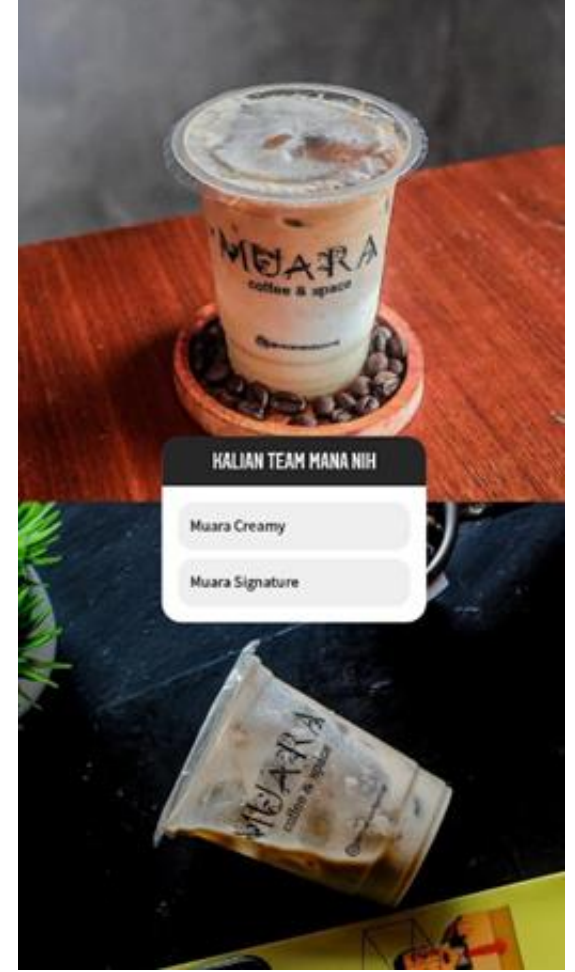
Figure 6. Poll Feature

This instagram poll was conducted to see how the consumer response from Muara Coffee and Space is shown in Figure 6.