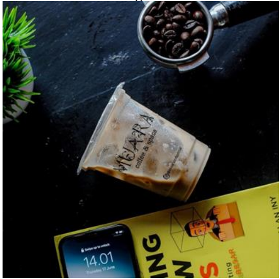
Figure 2. Muara Signature

Muara Cofee and Space has a lot of food and beverage products, of the many other products, Muara has one of the mainstay menus, namely Muara Signature. Muara Signature is an interesting thing for consumers, shown in Figure 2.