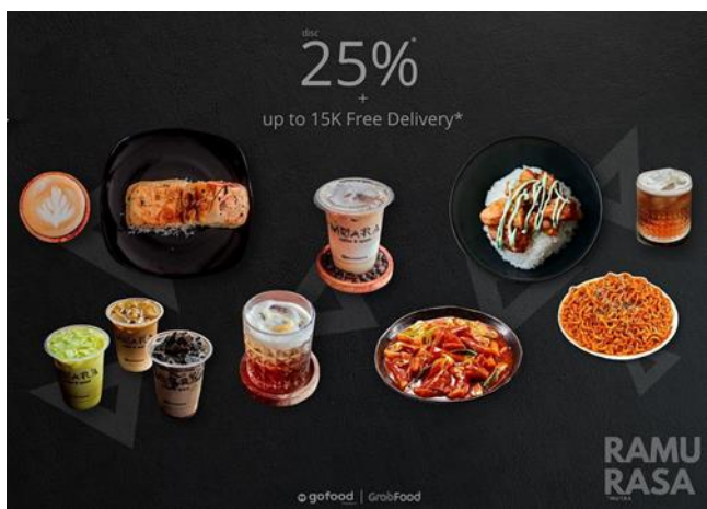
Figure 4. Discount Promos

The 25% discount promo from Muara Coffee and Space is one of the strategies used in its promotion, as shown in Figure 4.