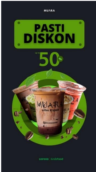
Figure 5. Discount Promos

In addition, there is also a 50% discount for certain drinks to market their products, as shown in Figure 5.