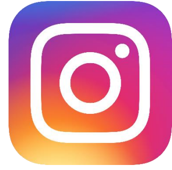
Figure 3. Instagram

NapoleonCat is a social media marketing analytics company based in Warsaw, Poland. This website aims to observe demographic updates for every country in the world by analyzing, observing, and studying various information about social media users used by every country in the world (Figure 3).