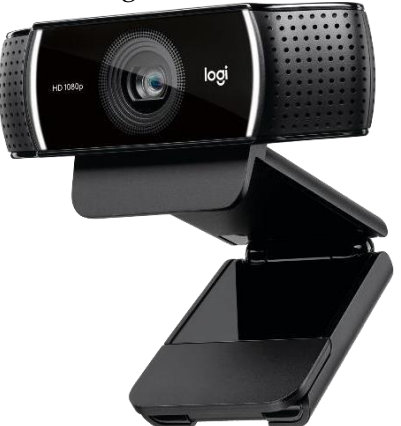
Figure 4. Webcam

Unfortunately, this webcam is only capable of being connected to a computer system, so it cannot be carried anywhere, but for now, the webcam monitoring camera is capable of connecting via the internet. So that homeowners can monitor the state of the house through a webcam. Notice in Figure 4 . the following is a form of a webcam.