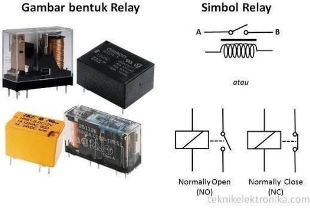
Figure 3. Relayed shape module

The relay module is a device that uses electromagnetic force to operate a switch system. This relay is composed of a coil of electrically conducting wire wrapped around an iron core. If the coil of wire is energized, then the magnetic field generated will attract the shaft which is used to leverage the magnetic switch mechanism. Figure 3 . The following shows the shape of the relay module.