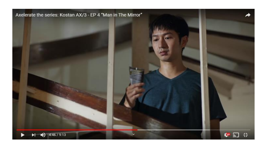
Figure 2. A scene from Axelerate the series: Kostan AX/3.

packaged attractively so it doesn't bring a commercial impression. This can be seen from how the appearance of Axe products has not been highlighted since the beginning of the episode so it doesn't disturb the storyline (See Figure 2).