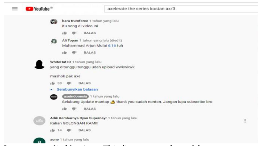
Figure 4. Comment replied by Axe . This figure was adopted from www.youtube.com/ on Oct 22 2019.

The use of digital media such as Youtube also certainly makes the brand more easily interact with consumers, the simple example is when the brand replied comment, this does seem trivial but it will make consumers feel more recognized so there is more closeness (See Figure 4).