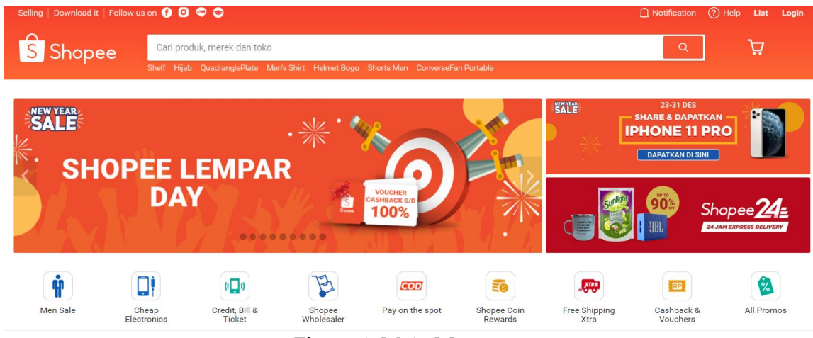
Figure 1. Main Menu

various devices that have internet access. In E-Commerce reviews written and rated by customers are an attraction for customers to recommend and terminate to buy, daily games, lots of promos, lots of discounts, sale of goods can be taken by the shipping service, free, simple, easy, and practical, satisfied, happy, safe with a short time makes it easy for the seller and also the buyer (Figure 1).