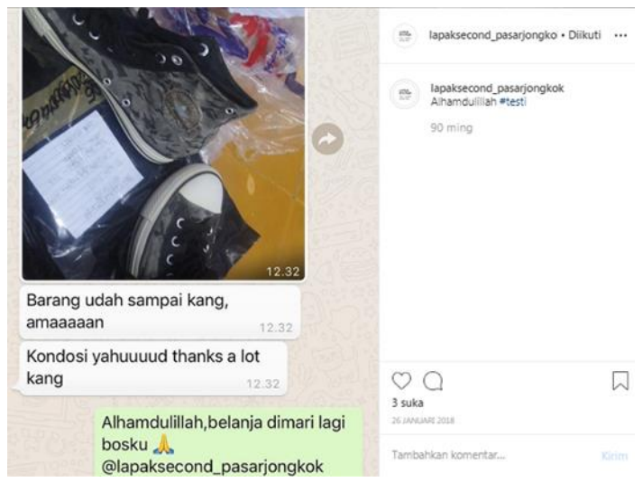
Figure 4. LSPJ chat rooms and testimonials

people and consumers. Besides, this direct interaction is also used to carry out testimonials on Lapak Second Pasar Jongkok services and products (See Figure 4).