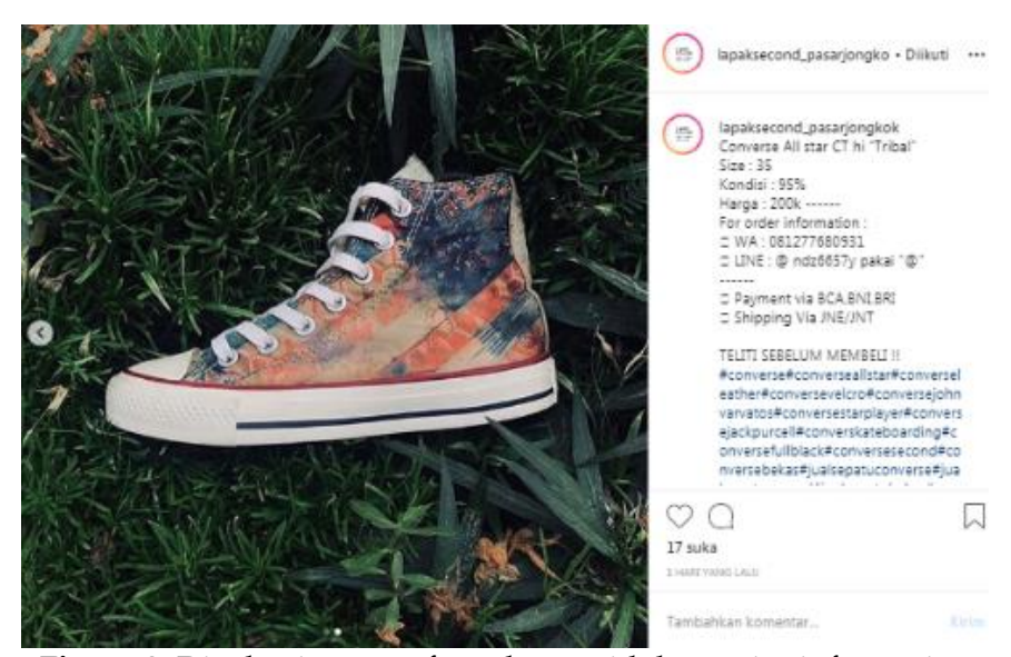
Figure 3. Display images of products with low price information

Entrepreneurs must have consideration in choosing a product or see other market prices that have similarities in product sales. In the post, there is clear information in the picture starting from the name of the item, size, price, number that can be contacted, and the method of payment. It can be seen, such as an affordable price offer with good quality being the selling power for Lapak Second Pasar Jongkok (see Figure 3).