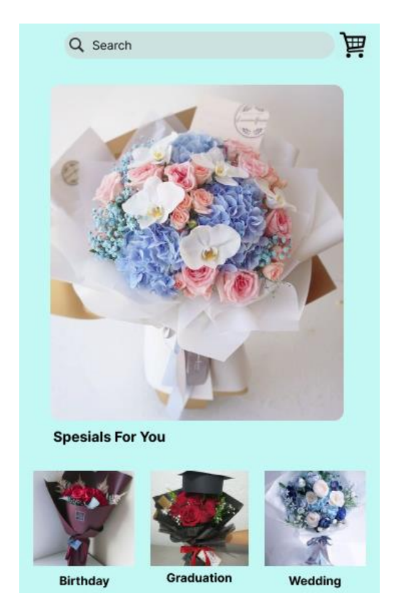
Figure 1. Bucket Sales Home Page

Many processes have been passed, both from the materials and tools used, the promotion process, as well as the benefits that must be obtained whether reaching the target or even losses from the results of an inappropriate strategy. With the development of the creativity of young millennial businessmen today, business actors must really pay more attention to a SWOT analysis in order to find out a threat, weakness, opportunity, and strength. As time goes by, this snack bucket continues to update ideas, creativity, innovation where at first it was only a snack bucket but also made doll buckets, money, cigarettes and so on according to consumer demand, in order to be able to maintain this business especially during the covid-19 pandemic as it is today so that it can compete with competitors who continue to increase excellence in each beautiful bucket gift in attracting its customers. [2] The implementation of the website can be seen in the image below: