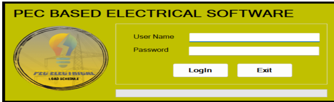
Fig. 2. Welcome page of the program

exit button, then the software will continue to exit.