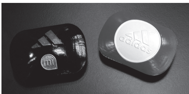
Figure 3. Micoach mock-ups.

Currently, adidas is studying the proposal in order to evaluate the possibility of creating a student community at Tecnun.