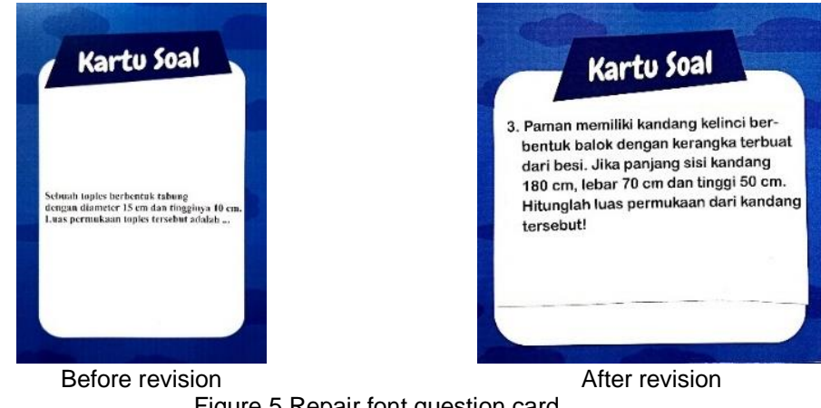
Figure 5 Repair font question card

Based on the comments and suggestions from the media experts, the researchers made improvements by changing font Serif that is Times New Roman be fonts Sans serif that is Arial Rounded MT Bold.