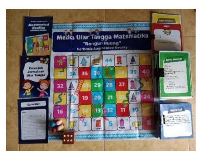
Figure 2 Mathematical Snakes and Ladders Media

this building material usinggame engine Unity 3D 2017.4.15. The appearance or form of the mathematical ladder snake media can be seen in the Figure 2.