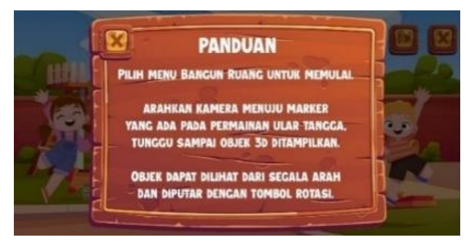
Figure 4 Display KD and Indicator Menu & Guide Menu

Learning media based mathematics snakes and ladders Augmented Reality that has been developed, then consulted with the supervising lecturer to ask for suggestions and comments. Then, validation is carried out using the assessment instrument that has been made. The validation stage was carried out by media experts, material experts and class teachers. This validation aims to obtain comments, suggestions and feasibility assessments of products developed by researchers as a reference for improvement.