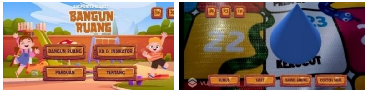
Main Menu Augmented Reality Build Room Menu Augmented Reality Figure 3. Display of the Main Menu & Room Building Menu

The image above contains the components in the mathematical ladder snake, which include the game board, cover media, game instructions, question cards, answer cards, challenge cards, cards zonk, score cards, pawns, dice and a box where toys are stored. Then, for the display of the Augmented Reality application, it can be seen in the Figure 3.