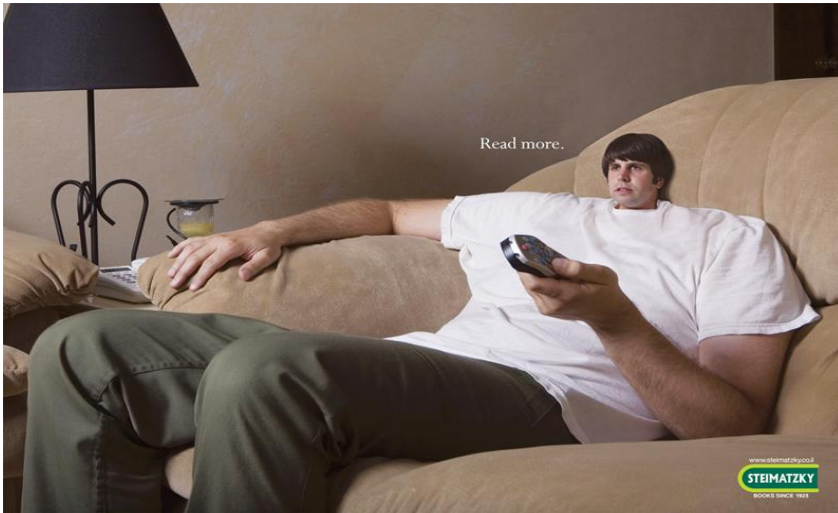
“Read More” campaign by the Israeli bookstore Steimatzky

I think that the argumentative Image 2 is a case of distributed cognition for both the institutional—or collective—speaker (Steimatzky Bookstore) and the potential viewers. As a multimodal piece of communication (combining visuals, written text, colour, etc.), its persuasive force is in every element that constitutes its message, none is capable of conveying its persuasive force by itself. The written text “Read more” cannot reach its argumentative completeness on its own, without both the young man with the small head and big body and, the sign of the brand “Steimatzky Bookstore.”