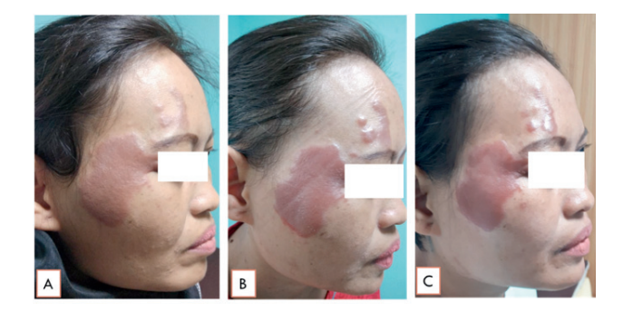
Figure 3. The Skin Lesion on Her Face at The First Come (Picture A), 3<sup>rd</sup> Month of MDT (Picture B); and after 6<sup>th</sup> Month of MDT (Picture C). We Found No Progression of The Lesions.

Based on these findings, from physical and laboratory examination, the diagnosis of multibacillary, borderline lepromatous (BL) leprosy with HIV coinfection was established. There was no sign of the leprosy reaction at this time. The patient were observed for the period of time to observe the amendment of her condition.