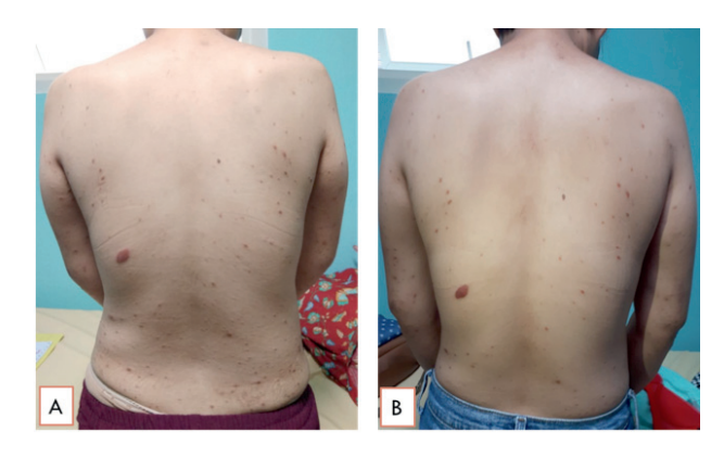
Figure 5. The Lesions on Her Back Were The Same between Her First Come (Picture A) and After 6th Month of MDT (Picture B)

Figure 4. The Skin Lesion on Her Forearms at The First Come (Picture A), 3<sup>rd</sup> Month of MDT (Picture B); and After 6<sup>th</sup> Month of MDT (Picture C). We Still Found No Progression of The Lesions.