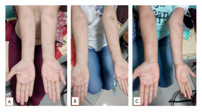
Figure 4. The Skin Lesion on Her Forearms at The First Come (Picture A), 3<sup>rd</sup> Month of MDT (Picture B); and After 6<sup>th</sup> Month of MDT (Picture C). We Still Found No Progression of The Lesions.

Talhari et al. were proposed the classification for leprosy associated with HIV infection. This classification recognizes true leprosy-HIV coinfection, opportunistic leprosy disease, and leprosy related to ART.<sup>8</sup> Recently, it was suggested that even though leprosy–HIV coinfection does not manifest homogenously across affected populations, immunological features seem to be shared by certain subgroups. In this context, a clinical classification of M. leprae and HIV/