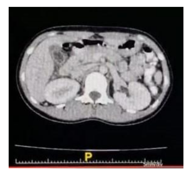
Figure 2. Abdominal CT demonstrated diffuse thickening of gallblader wall (8 mm) and pericholecystic fluid without any calculus found (white arrow).