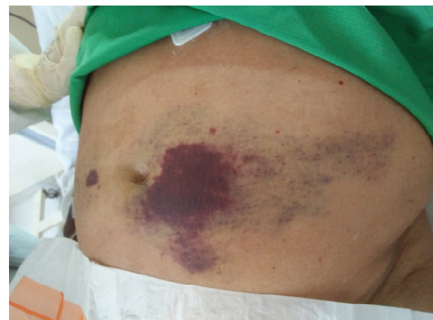
Figure 3. Abdominal appearance indicating suspicious acute pancreatitis.

Based on the results of the examination, the patient was diagnosed with COVID-19 and acute pancreatitis. Some of the most common etiologies of pancreatitis are etiologies such as gallstones, alcohol, pancreatitis-causing drugs such as furosemide, thiazide, sulfa, hypertriglyceridemia, other viral infections, autoimmune, posttraumatic were not found in this patient. Besides, the use of Clopidogrel might considerably be also one of the triggering factors since Lai et al. declared that persons actively consume Clopidogrel were at 8.46-fold increased odds for acute pancreatitis. 27 therefore, However, Tthe diagnosis of the cause of acute pancreatitis can be confirmed by autopsy to detect SARS-CoV2 in pancreatic cells. But we could not nt performed it because this examination was not done routinely.