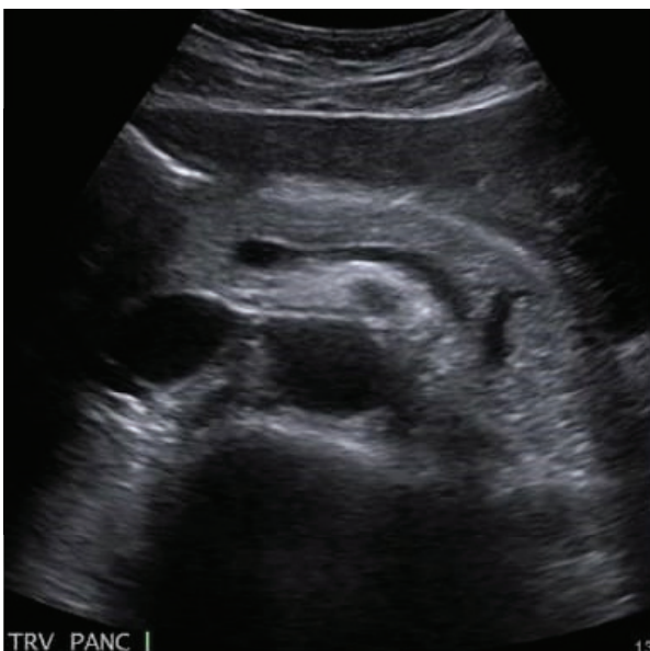
Figure 2. Ultrasonography of Pancreatitis.

On the third day of treatment, we found that the patient's right upper abdominal pain was severe. Unfortunately, our abdominal examination found discoloration of the left flank that we suspect as pancreatitis (see Figure 3). Subsequent laboratory tests showed an increase in amylase number 138 U / L and lipase 200 U / L with normal liver function. Serum cholesterol was normal. The inflammatory markers of CRP did not show an increase of 0.7 mg / L while procalcitonin was 0.36 ng / mL. Abdominal ultrasound results showed a slightly enlarged pancreas with a very hypoechoic structure (see Figure 2). At the current examination, we found a positive Ranson prognostic Ranson's score for acute pancreatitis for the variable age 83 years. However, after a 48-hour evaluation, there was a positive Ranson criterion for increased hematocrit, urea, and base excess deficit. Therefore, the prognosis of mortality is around 11-15%.