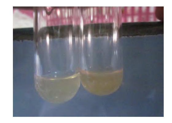
Figure 2. Control solution