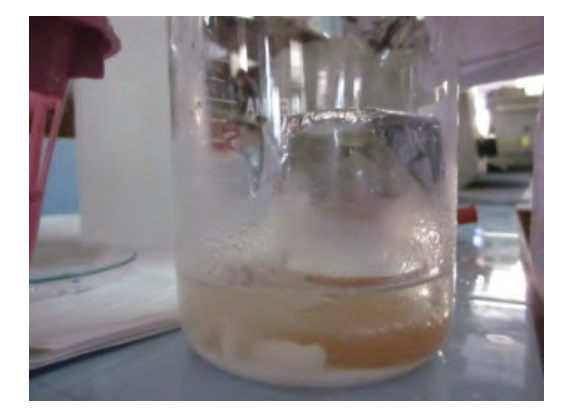
Figure 1. Citrate plasma

Blood clotting test is conducted by mixing the essential oil dilution with plasma citrate in four different reaction tubes. A solution of CaCl_2 is then added into the mixture. The fourth solution is formed in yellow-brown color with different intensities of concentration. The color intensity for the solution concentration of essential oil with \frac{1}{2} times dilution is higher or more concentrated than the essential oil