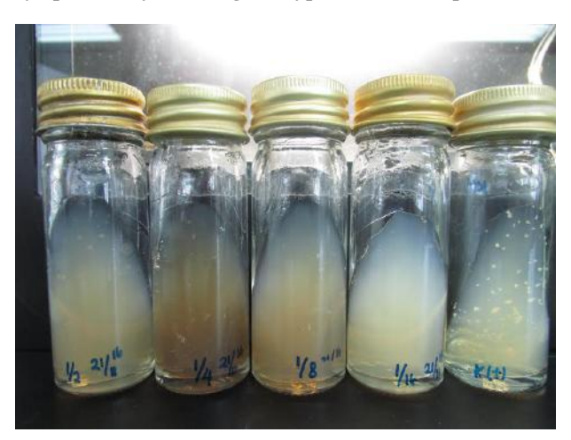
1/16 times 1/8 times \frac{1}{4} times \frac{1}{2} times

Meanwhile, piperine is an active compound in Piper belte L. extract. In the literature, piperine of 1.0 and 10 µg/ ml showed an up-regulation of IFN- \gamma and IL-2 production in Mycobacterium tuberculosis . An effective immunestimulant can complement the host cellular immune response by specifically inducing the type 1 (Th-1) response.<sup>17</sup> In