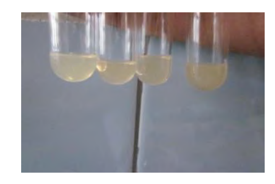
Figure 3. Dilution of essential oil with citrate plasma

with 1/16 times dilution. This solution results in the same color with the earlier control solution (Figure 3-4).