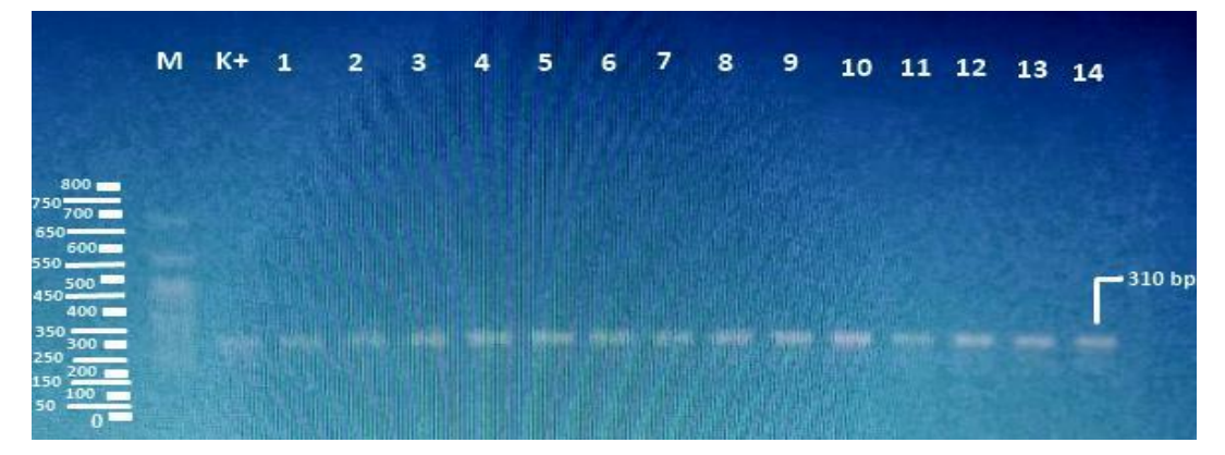
Figure 1 . Agarose gel electrophoresis of PCR product amplified from MecA gene (310 bp). M is DNA marker; K(+) is positive control, Lane 1-14 are MecA fragments.