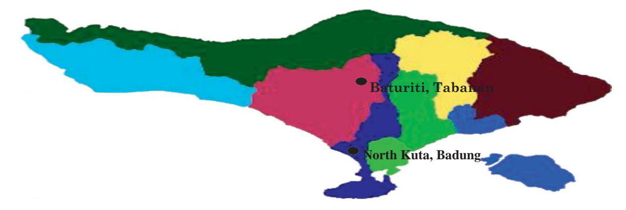
Figure 1. Map of Sampling Location. Dark Blue Colour is Badung District and Pink Colour is Tabanan District.

samples were taken in North Kuta sub-district, and in Tabanan district samples were taken in Baturiti sub-district. Geographically, Badung district located between 08°14'20" - 08°50'48" South latitude and 115°05'00" - 115°26'16" East longitude. North Kuta sub-district has an area of 33.86 km<sup>2</sup> with an altitude of 0-65 meters above sea level. North Kuta sub-district was located in the lowlands close to urban areas. Geographically, Tabanan district located between 08°14'30" -08°30'07" South latitude and 114°54'52" East longitude. Baturiti sub-district has an area of 99.17 km<sup>2</sup> with an altitude of 465-2082 meters above sea level. Baturiti sub-district waslocated in the highlands of rural areas. Dark blue colour is Badung district and pink colour is Tabanan district (Figure 1). A total of 100 pig fecal samples were taken randomly, from Badung and Tabanan districts consisted each 50 samples. Samples collection were conducted from 15 - 22 January 2018.