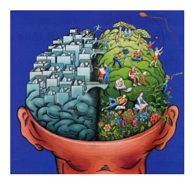
Figure 1 (Atkin J. 2000, p. 6)

The term brain duality means that the functions of both hemispheres, left and right, should integrate in such a way that the whole brain, of the student in our case, is involved in the learning process.