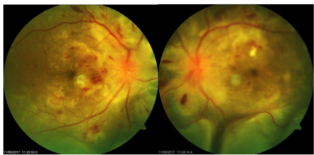
Figure 4. Fundus Photography After 3 Weeks Show Reducing Of Bilateral Disc Edema, Retinal Bleeding, And Exudative Retinal Detachment