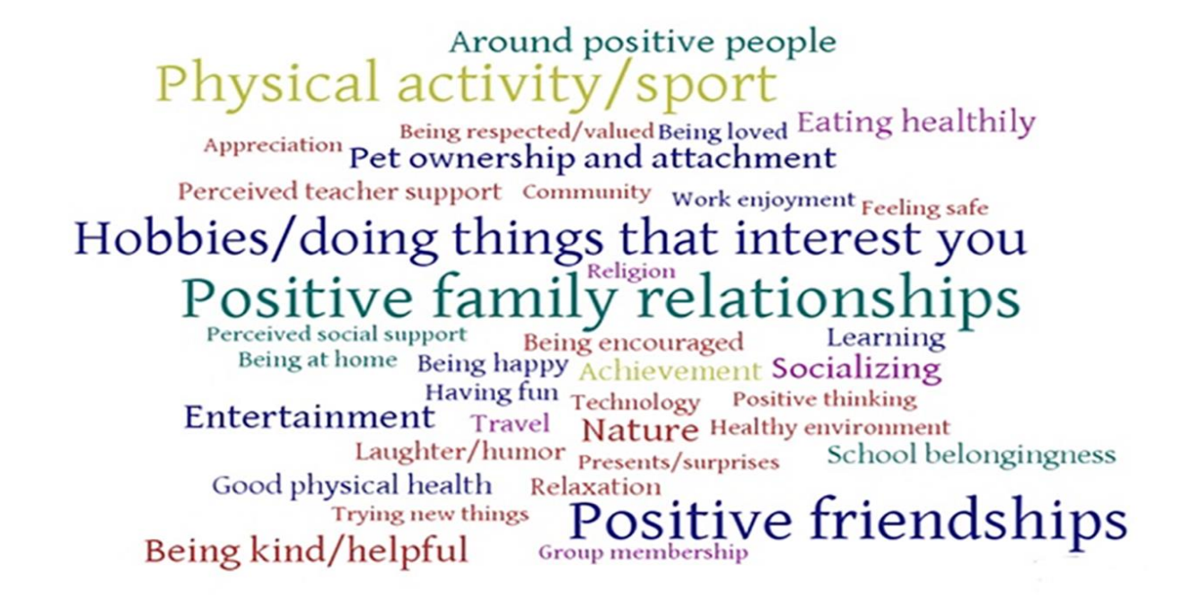
Figure 1. Adolescents' pathways to wellbeing.

percentage was 10.8%. Both socioeconomic groups frequently listed positive family relationships, positive friendships, and physical activity/sport as pathways to wellbeing.