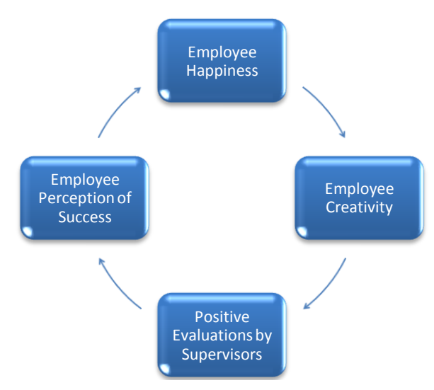
Figure 2: Employee Creativity and Happiness

Cohen-Meitar, Carmeli and Waldman (2009) provide findings which suggest a virtuous circle may exist for creativity and happiness in the workplace (see Figure 2 below). This study revealed that employees who found their work to be meaningful (i.e. personally important to them in some larger intrinsic sense) identified more strongly with the organizations which employed them, and also felt happier at work. Furthermore, employee happiness was associated with increased productive creativity at work, as assessed by the employees' supervisor . Since supervisors usually convey their evaluation of employees to those employees, it's reasonable to assume that employees whose supervisors believe them to be highly creative and productive should on average come to see themselves as relatively more successful at work. Other research has shown that feeling successful at work is strongly linked to happiness (Warr 1999). Combined, these findings suggest a positive feedback loop whereby employees who experience work as a meaningful and happy activity become more creative in productive ways, which is in turn noted by their supervisors, and thus increases the employees' assessment of their own professional success, which finally produces yet more happiness for those employees.