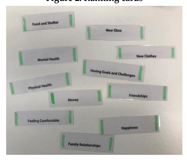
Figure 2. Ranking cards

The focus group was semi-structured and included one activity where participants, in pairs, had to rank 11 cards in order of importance to their wellbeing (see Figure 2). The content of the activity was derived from a review of literature. Each card was a determinant of wellbeing with items such as 'xbox' representing hedonic pleasure, 'having goals and challenges' representing eudaimonia and 'food and shelter' representing basic needs. The activity was designed to encourage discussion around topics prevalent within wellbeing literature. During the interview, participants split into groups of two and were given a set of 11 cards. They were asked to rank