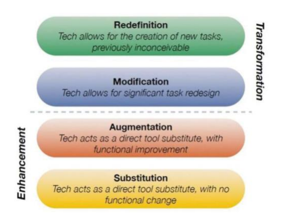
Figure 1. SAMR model. (Puentedura 2013.)

Substitution is the use of technology for a task that could be accomplished without technology. Augmentation provides a technological improvement for a task that could be completed without technology. Modification allows for a pre-existing task to be significantly altered in a way not possible without technology. Finally, redefinition would be the creation of a completely new task not possible without the technology.