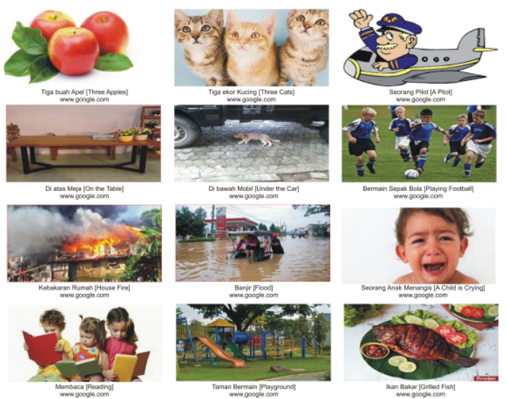
Figure 1 Pictures Used as Visual Aid in Interaction

displayed by the researchers in obtaining recorded utterances and because they were considered to improve the ability to speak for children with mental retardation (Afifah &Soendari, 2017). The results of the were transcribed and recordings then analyzed by focusing on utterances related to syntax device disorders which included word orders, parts of speech, intonations, and particle defects, and syntax unit disorders which included defects in phrases, clauses, and sentences. Analysis tables were used to help the data analysis process to stay focused on the main data analysis.