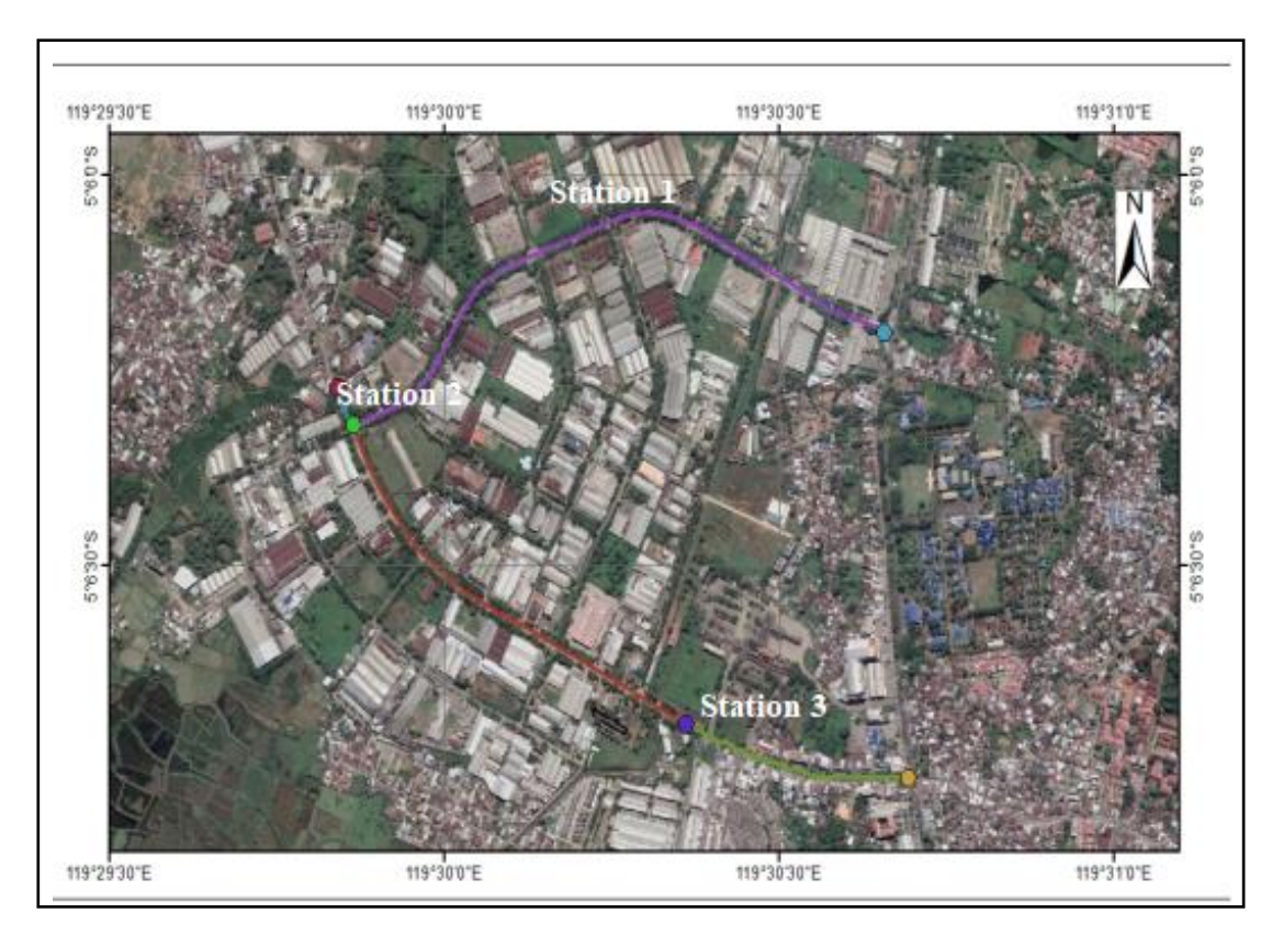
Figure 1. Map of the location of leaf samples of green champa plants ( Polyalthia longifolia ) in the Industrial Area of Makassar