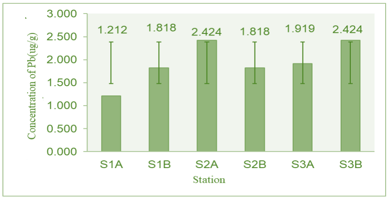
Figure 2. Heavy metal Pb concentration on green champa leaves in each station, i.e. S1 is station 1, S2 is station 2 and S3 is station 3; A is the upper leaf and B is the lower leaf.

From the observations of heavy metal concentrations showed the green champa leaves at each station. In the upper leaf and lower leaf that is relatively the same. At S2A and S3B the Pb concentration was 2.42 \mu g/g , then at S3A the Pb concentration was 1.91 \mu g/g . Furthermore in S1B and S2B with Pb concentration was 1.81 \mu g/g , as shown in Figure 2.