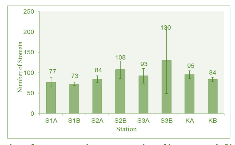
Figure 3. The number of stomata to the concentration of heavy metals Pb in Green Champa leaves at each station: i.e. S1 is station 1, S2 is station 2 and S3 is station 3; A is the upper leaf and B is the lower leaf; KA is the control on the upper leaf and KB is the control on the lower leaf.

The most number of stomata to the concentration of heavy metal Pb was at station 3 in the lower header (S3B) of 130 compared to stations 1 and 2 and control. Compared to Station 1, there were 77 stomata of the upper leaf (S1A) and 73 stomata of the lower leaf (S1B) of 73 stomata, this is quite a number (51 - 100) which is relatively the same as the control, as shown in Figure 3.