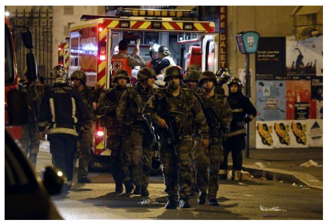
Disaster: At least 129