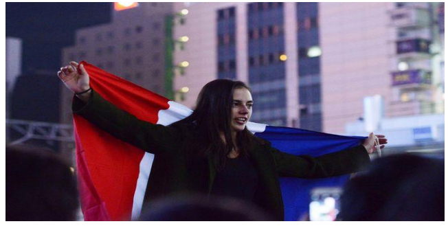
have lost their lives Solidarity:Support for France has been flooding in from across the globe