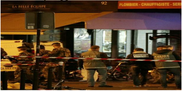
Response: Officers race to central Paris terror attacks