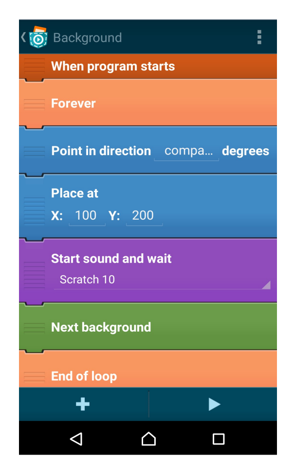
Fig. 3. Script's view in Pocket Code