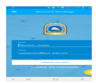
Fig. 6. Edit account