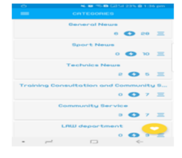
Fig. 4. Categories in the application