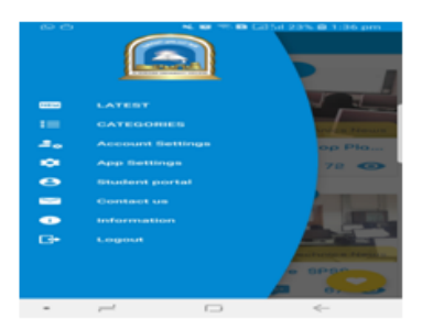
Fig. 5. Menu in application