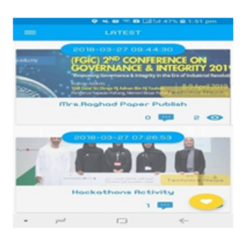
Fig. 3. Some news in the application

The system mainly consists of three actors- admin, registered users and unregistered users. The admin can update all the news and make necessary changes. Only a registered user can make comments on the news. Any user can view the news and access portal evenif they have no user id and password. The users can add, modify or delete his/her comment that they add. And the users can control the notification accepted in their mobile, for example- if a student requires only news related to their major such as the student in information technology department only want the news of their major and may not want the news of business department or English department, they can disable the notifications. Thus, the users have a priority to select the news they want. Figures 3,4,5 and 6 show some of the windows of the application.