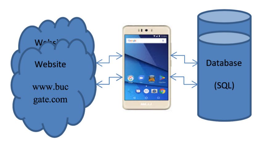
Fig. 2. Mobile application design model

The application helps the students and employees to facilitate the process of obtaining news. The system is very user-friendly and does not have any complex aspects that confuse students or employees or any users. This application starts with mobile application interface, which include many features that make it easy to keep track with latest news of college. Figure 2 shows the mobile application design model.