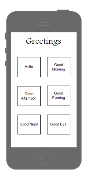
Fig. 1. The wireframe of the communication board (CB)

After that, the design is then coded into the actual application or in prototype form. Fig. 2 shows the display in the prototype of the communication board (CB). The users can try the prototype by themselves and in the next phase of UCD process, the evaluation can be done by asking the users' opinion.