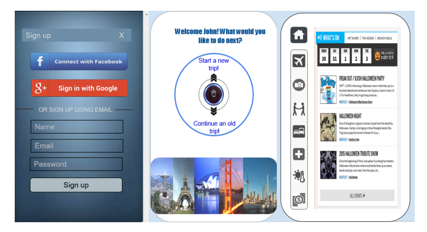
Fig. 2. Screenshots of the SCATA prototype

Figure 2 presents sample screenshots of the functional prototype of the SCATA. These screenshots represent the home screen of the SCATA when a tourist arrives at the airport/city in a foreign country. The user has a set of basic services at hand, such as the time, weather, a currency converter, local emergency phone numbers, departure and landing schedules, and the ability to search for places to visit.