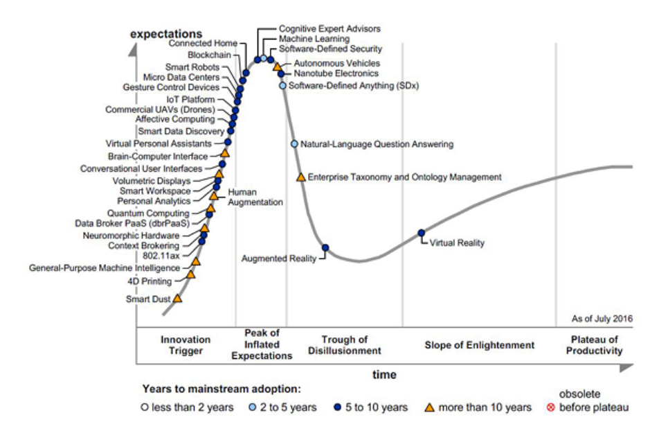
Fig. 1. Hype Cycle for Emerging Technologies. Gartner. July 2016

phenomena, and that both of them are in a much less mature phase with respect to virtual reality, which is almost ready for large scale adoption and diffusion in 2016.