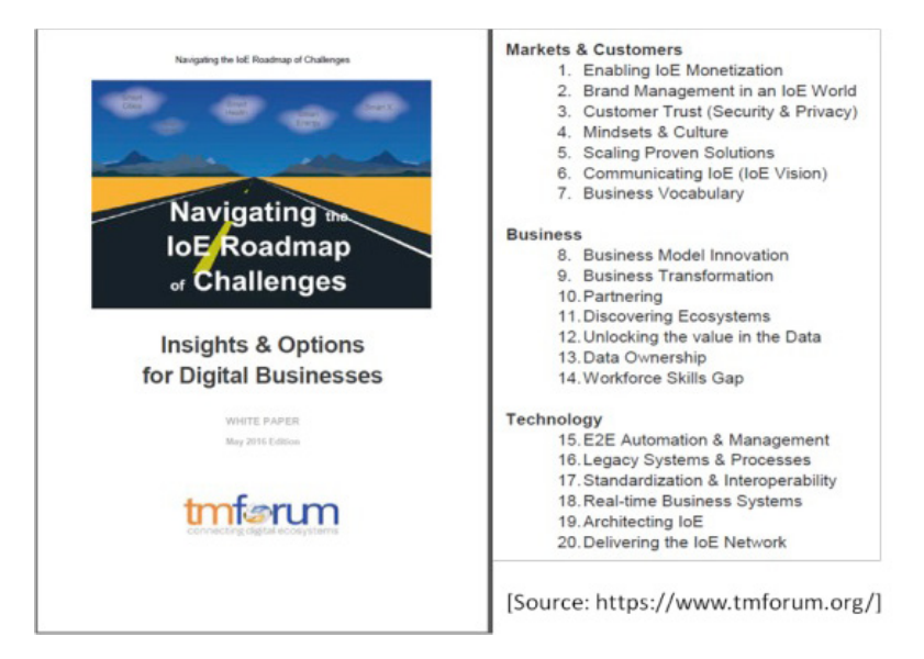
Fig. 2. TM Forum Report on Internet of Everything 2016. Table of Contents